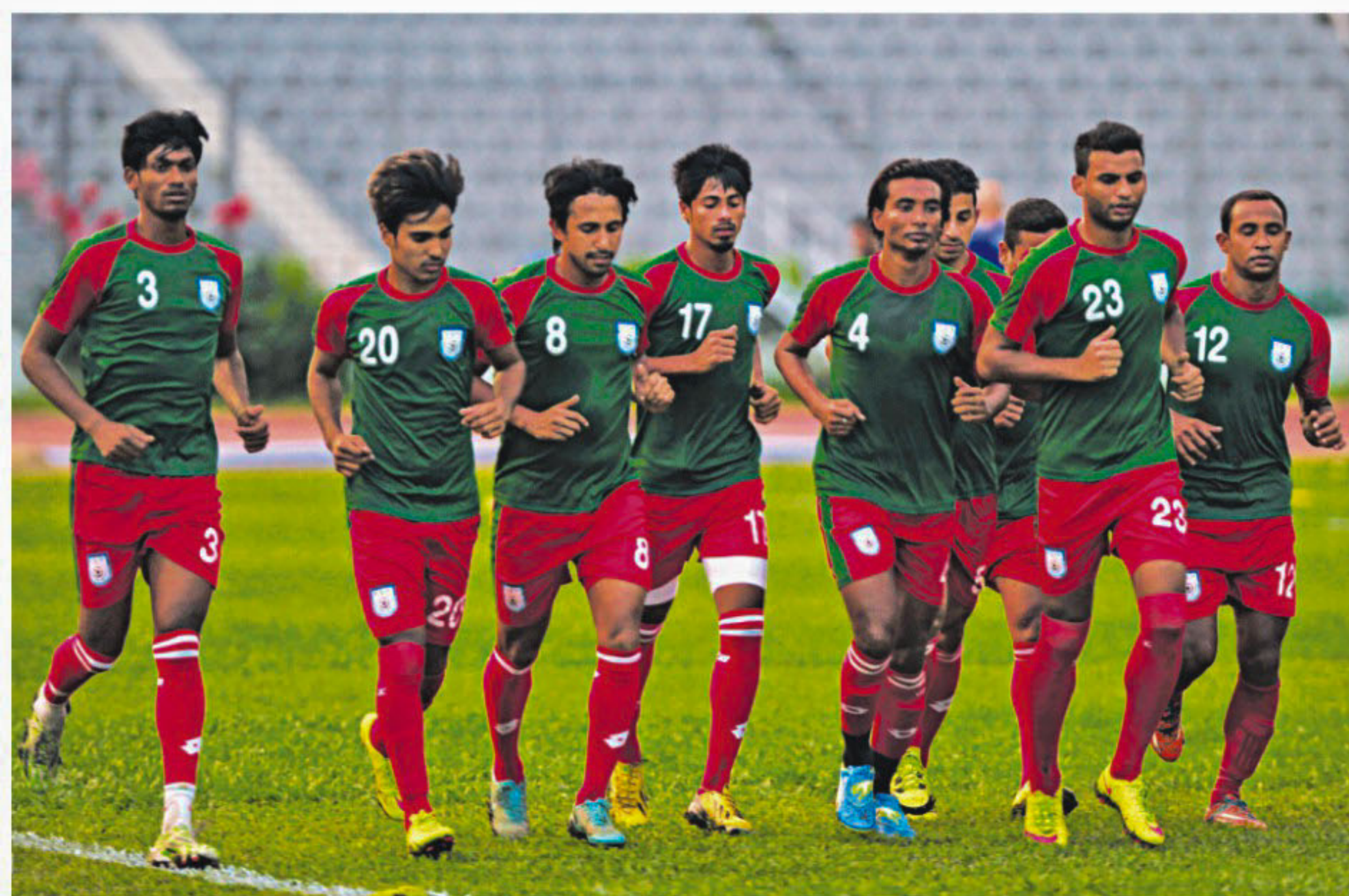
The Bangladesh footballers (L), seen here jogging at the Bangabandhu National Stadium yesterday, will need a disciplined and collective effort if they are to eke out a result against Jordan (R) in their World Cup-Asian Cup qualifying fixture today.