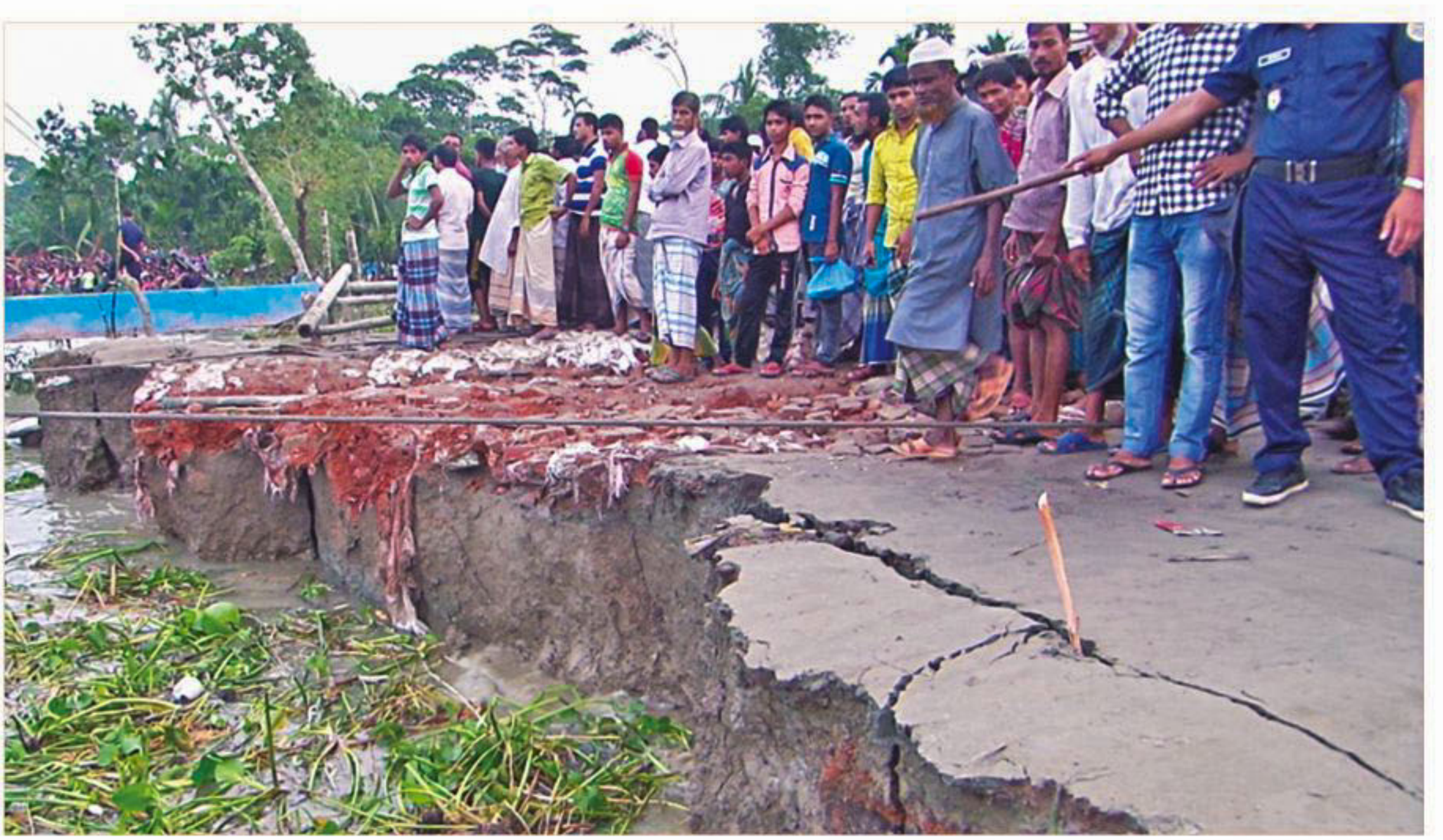
Villagers watch helplessly as the Meghna River devours Rajapur village in Bhola yesterday. The mighty river has been eating away its banks for the last 15 days.