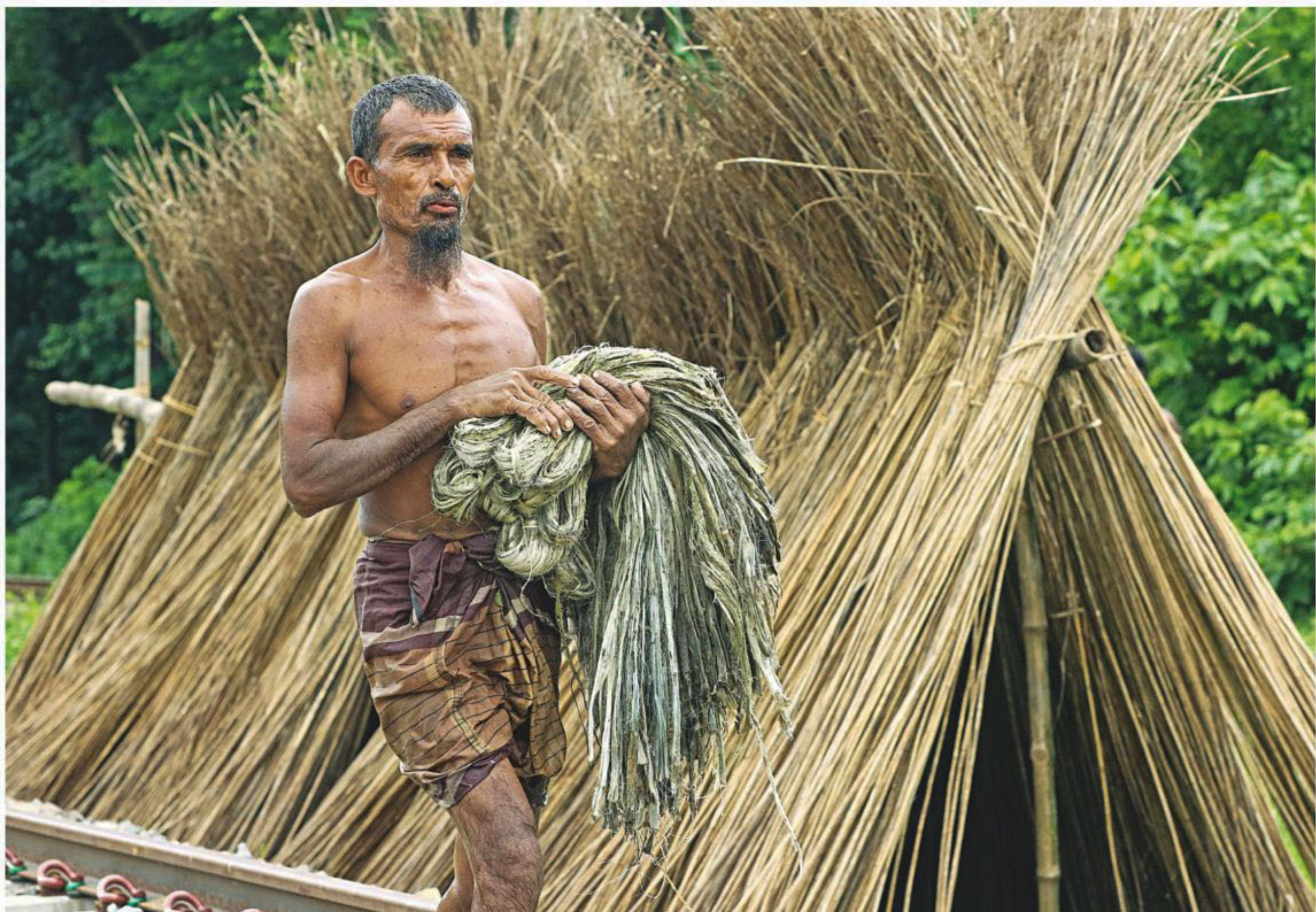
A farmer dries jute after washing it in a pond in Kaliganj of Gazipur. Farmers are hopeful that they will receive a higher price for jute this year compared to last year -- Tk 1,800 to Tk 2,000 per mound. The photo was taken yesterday.