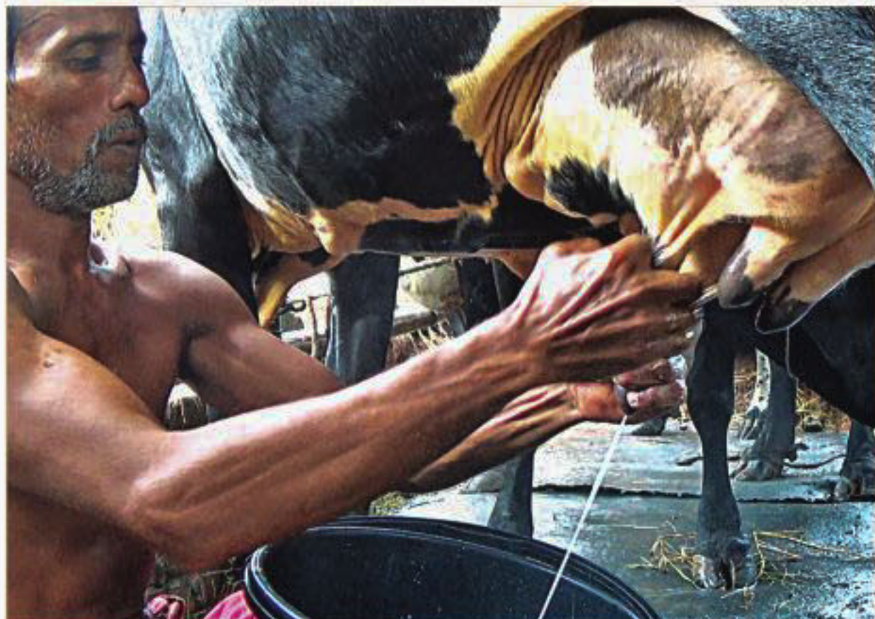
A dairy farmer milking a cow in front of a customer (not in the photo) at Rayerbazar in the capital. The idea of giving customers milk as fresh as it can be has caught on in the area.