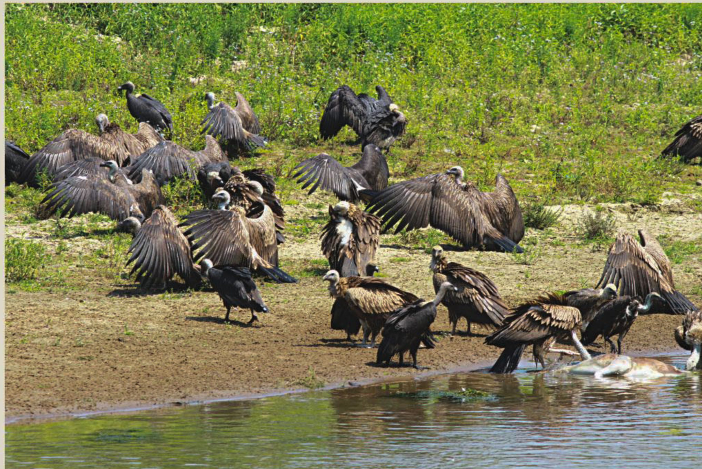
Less than 500 white-rumped vultures are left in Bangladesh and other species of vultures are disappearing. The reason is that the scavengers eat carcasses of cows that were injected with harmful chemicals.

SAKIB AHMED The torrents had just stopped and sunlight filtered through the bright green canopy above, forming columns of light spiraling down to the moist forest floor. The humidity was stifling and the forest eerily silent, as if held under a spell; every living being waiting for something to happen. Not even a leaf stirred; the birds had fallen quiet. We were surrounded by huge trees. The mighty garjans shot up towards the zenith, stood solemnly like silent SEE PAGE 17 COL 2