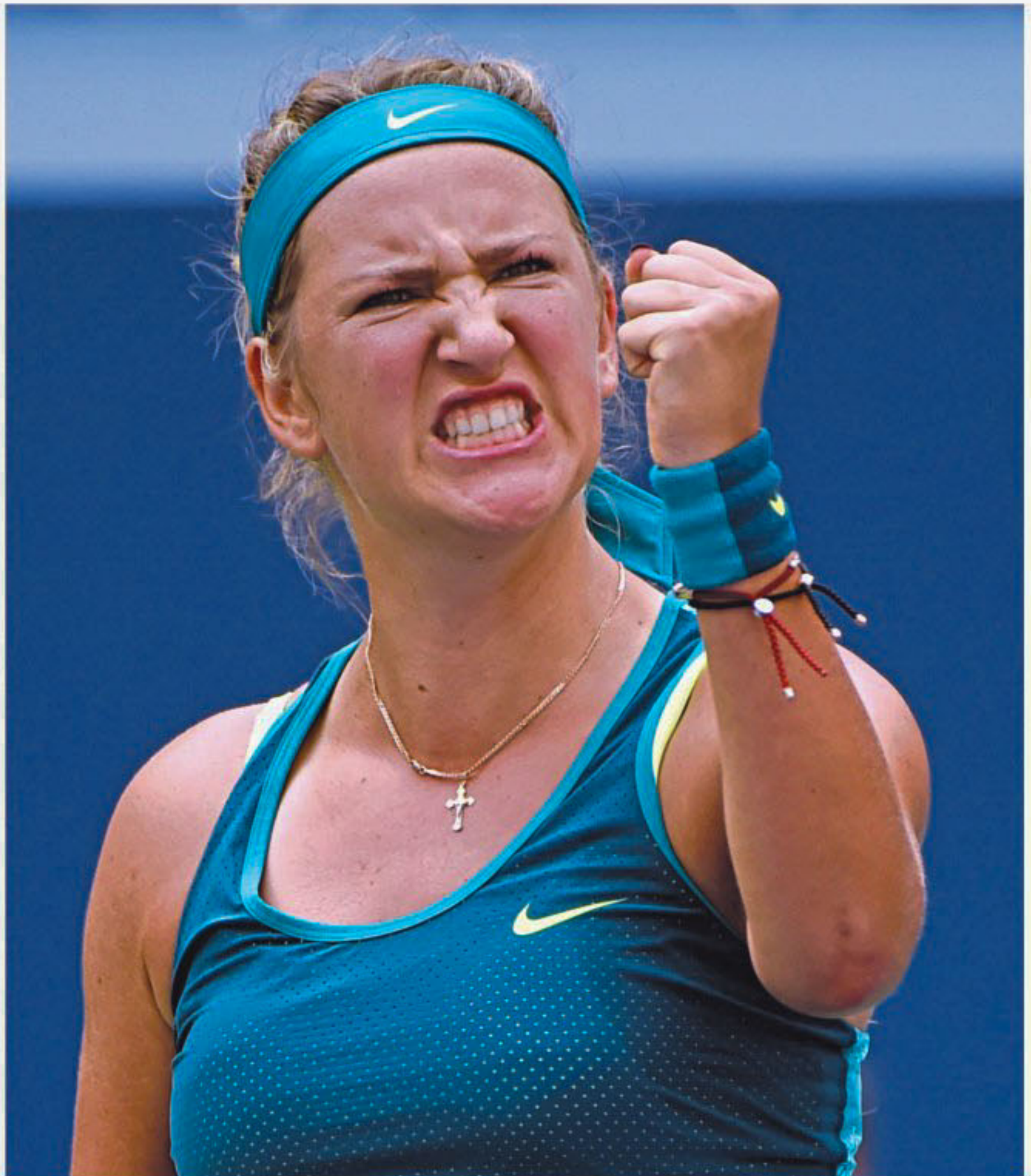
Victoria Azarenka of Belarus celebrates defeating Belgian Yanina Wickmayer in the second round of US Open at Flushing Meadows in New York on Thursday.