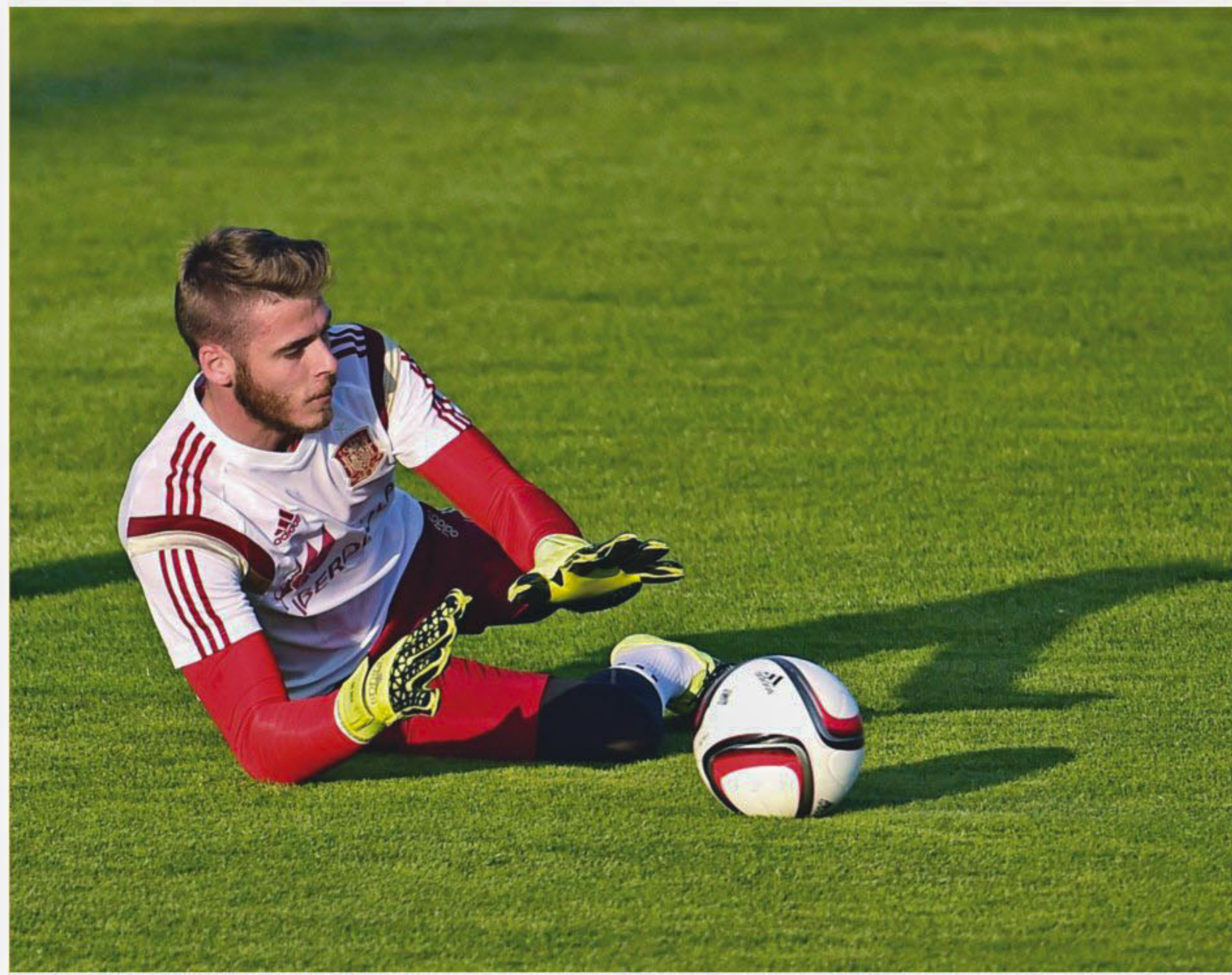
Manchester United goalkeeper David de Gea trains with the Spanish national team in Las Rozas Soccer City on Wednesday.