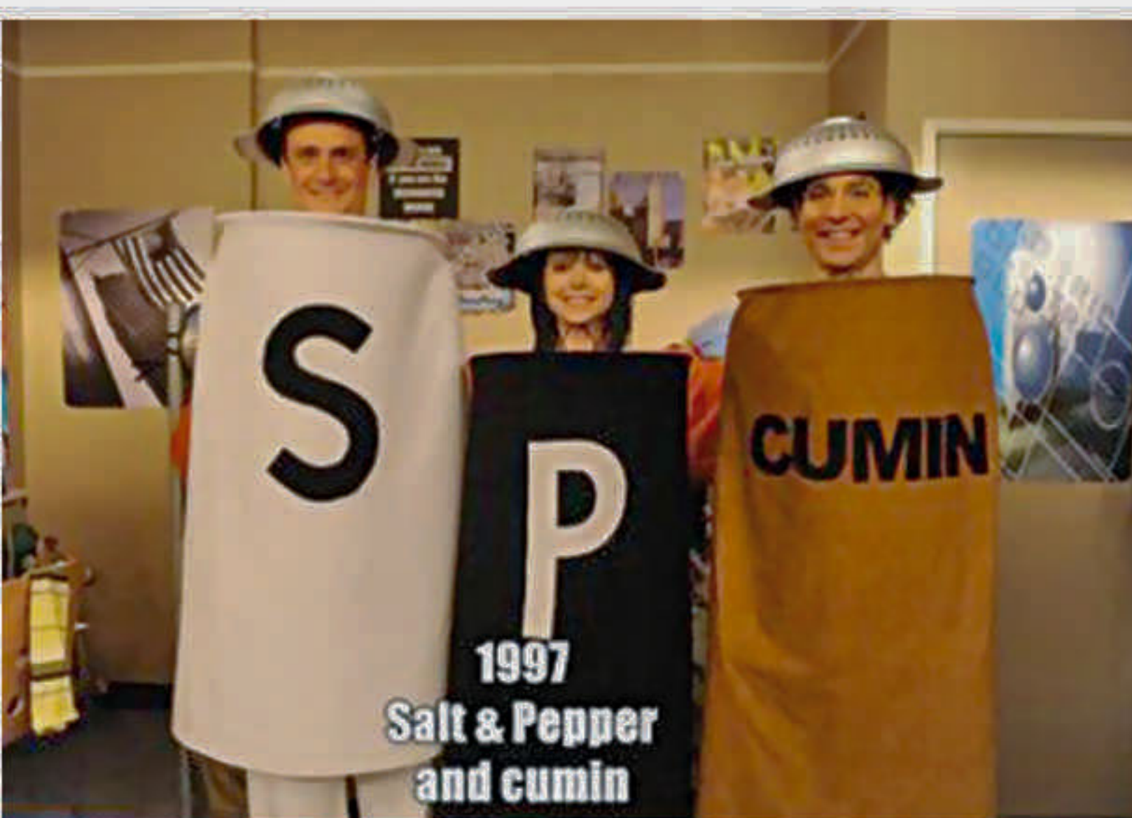
1997 Salt & Pepper and cumin