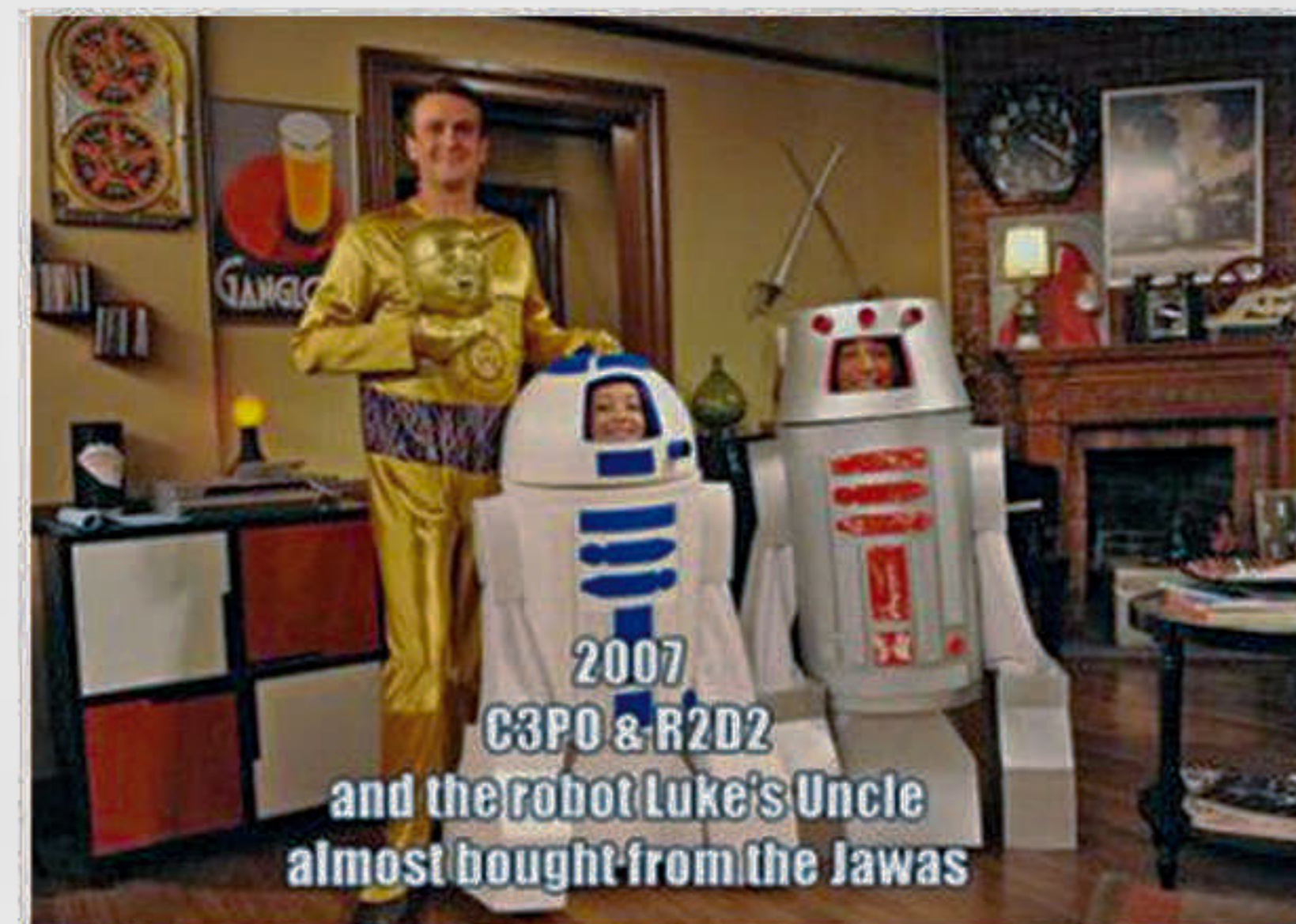
2007 C3PO & R2D2 and the robot Luke's Uncle almost bought from the Jawas