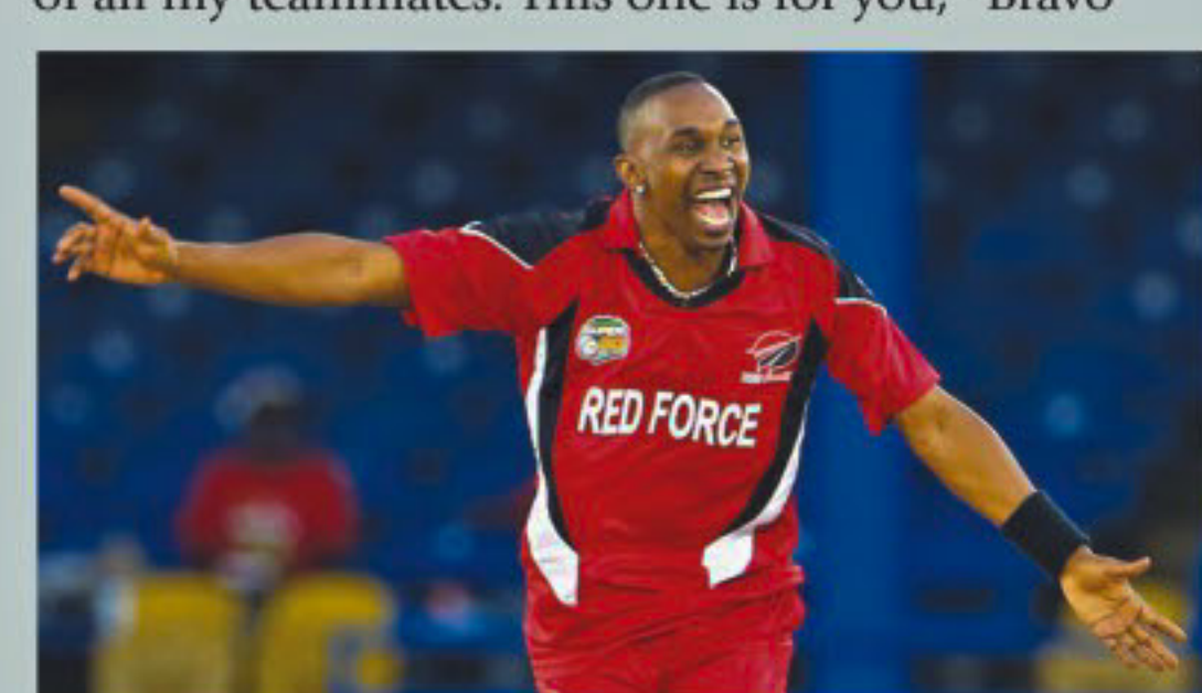
Compiled by Star Sport Desk

"Receiving the third highest award in Trinidad and Tobago, the Hummingbird Gold, for my contribution to sport. I could not have done it without the love and support of my fans and most of all my teammates. This one is for you," Bravo