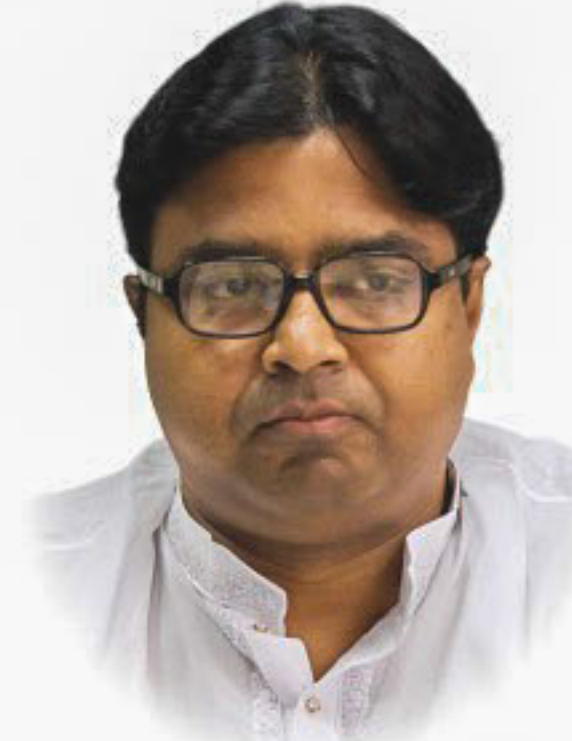
SAYEED KHOKON MAYOR, DHAKA SOUTH

Nobody knows the exact state of storm drainage facilities in the capital. Dhaka Wasa and the city corporations pass the buck between each other. I have instructed the ward councillors to come up with ideas on how to contain waterlogging in the city.