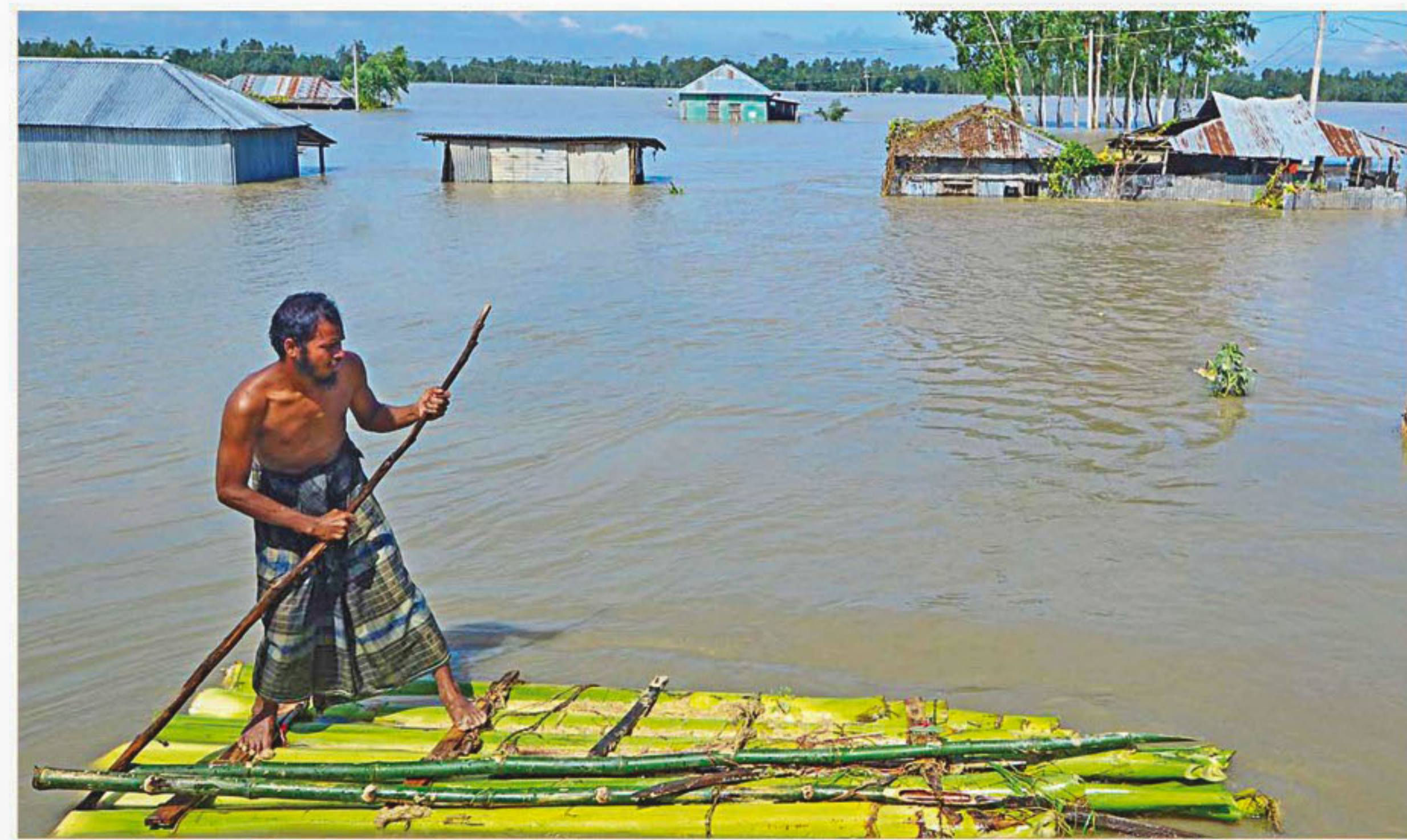
A man rows a raft made of banana trees to get to higher ground after his house at Rohodaha in Sariakandi of Bogra went under water, like the ones in the background.