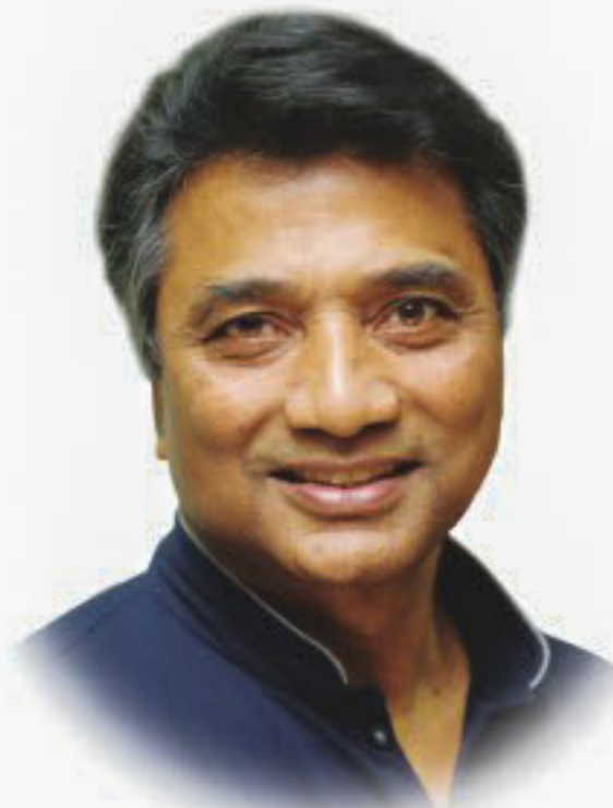
ANNISUL HUQ MAYOR, DHAKA NORTH

Nobody knows the exact state of storm drainage facilities in the capital. Dhaka Wasa and the city corporations pass the buck between each other. I have instructed the ward councillors to come up with ideas on how to contain waterlogging in the city.