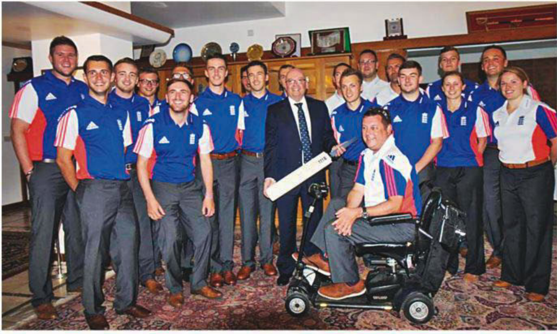
The England Disability cricket team enjoyed a day away from training yesterday when they were welcomed by the British High Commissioner at his residence in Dhaka. The English will take on their Bangladeshi counterparts on September 2.