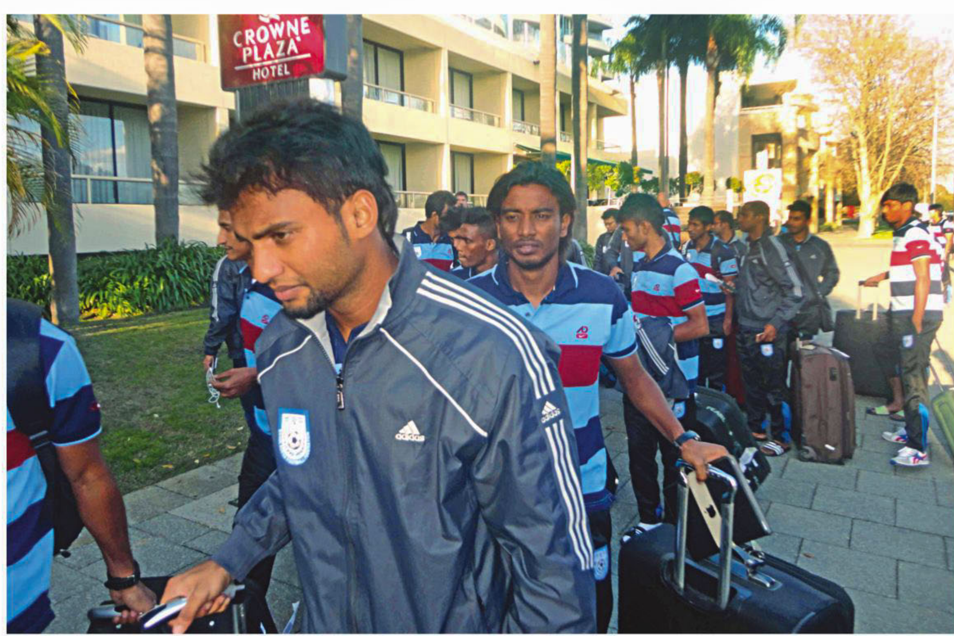
The Bangladesh football team arrive at the Crowne Plaza Hotel in Perth, Australia yesterday. Bangladesh will take on the Socceroos in a World Cup/Asian Cup Qualifier in Perth's NIB Stadium on September 3.