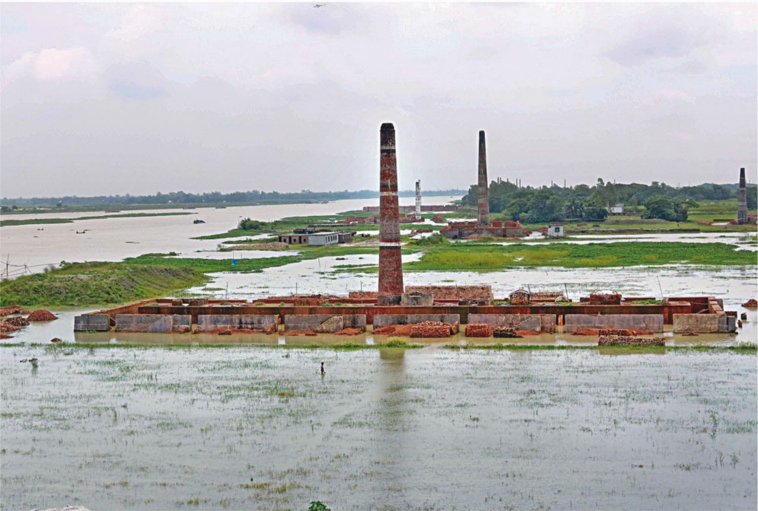
The ongoing countrywide flood has crept into the outskirts of the capital too. The Dhaleshwari River has spilled over flooding houses and brick kilns situated on its banks. The photo was taken from Dhaka-Mawa highway at Keraniganj yesterday.