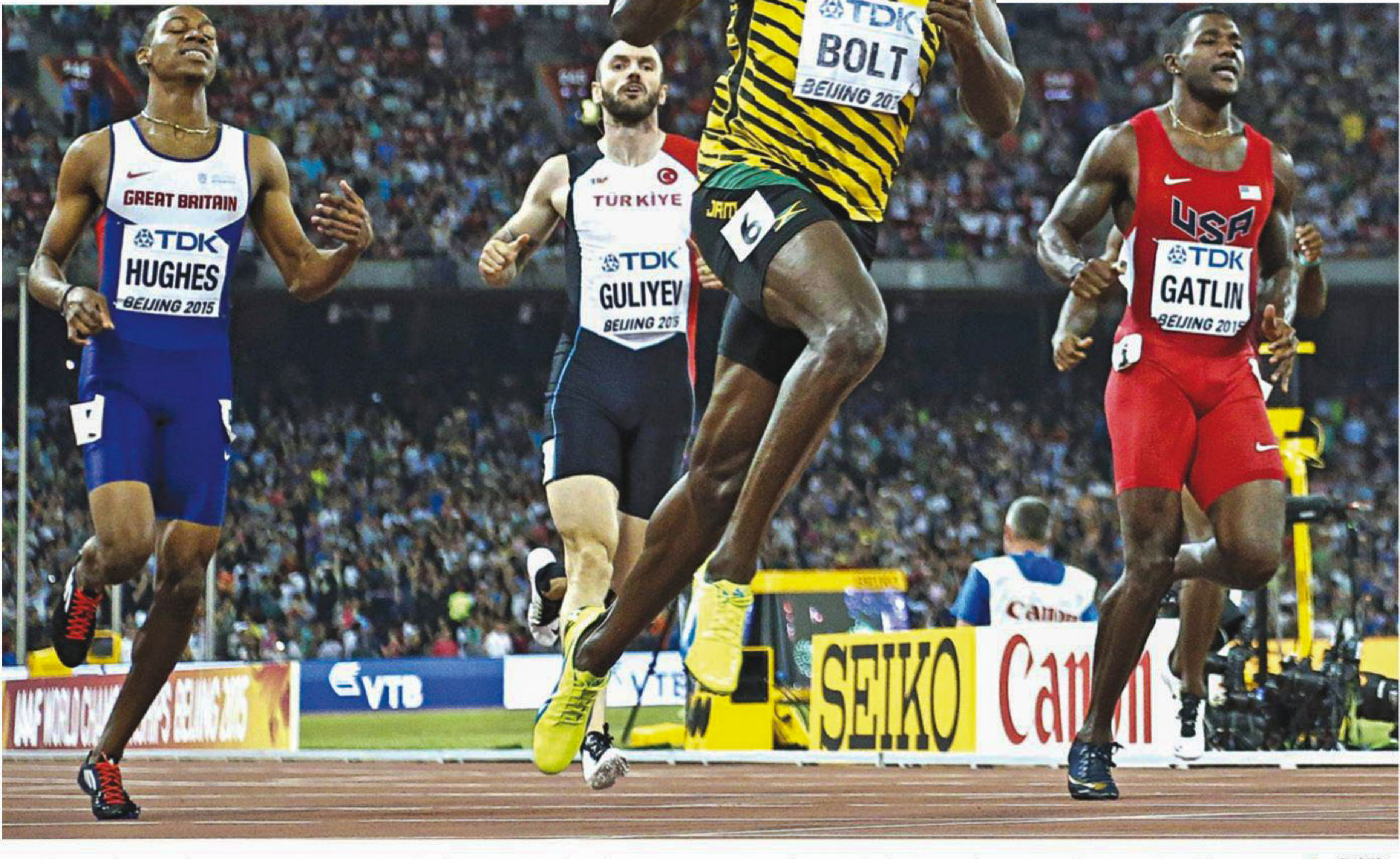
Jamaican sprinter Usain Bolt ran the 200 metre sprint in style, outpacing his nearest opponent, USA's Justin Gatlin, comfortably to clinch gold in Beijing.