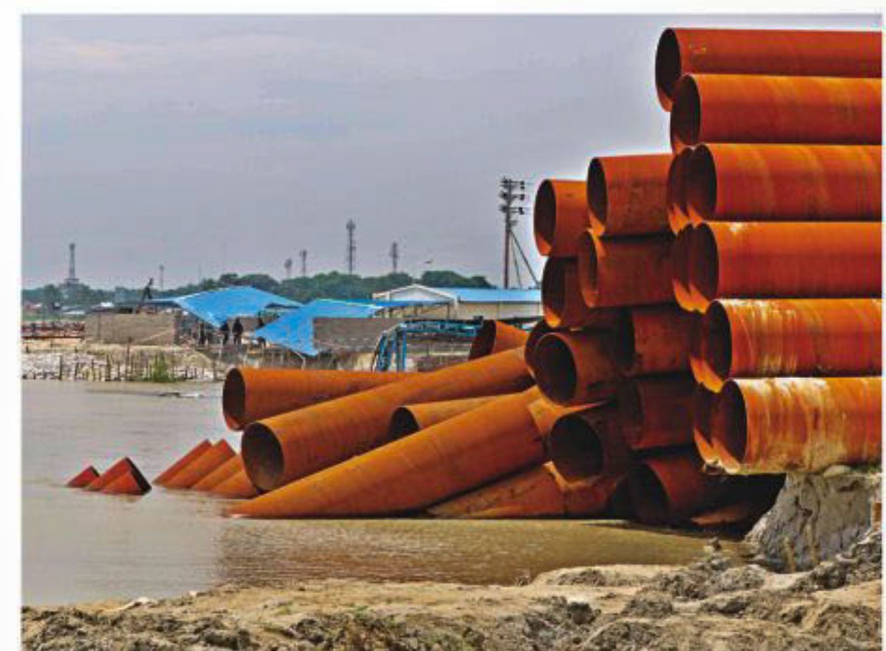
Large portions of two jetties at Padma bridge construction yard are eroded, left, and construction materials devoured, bottom right, by strong currents. Workers, top right, were seen trying to stop the erosion by putting sandbags on the banks, but to little use. The photos were taken yesterday.