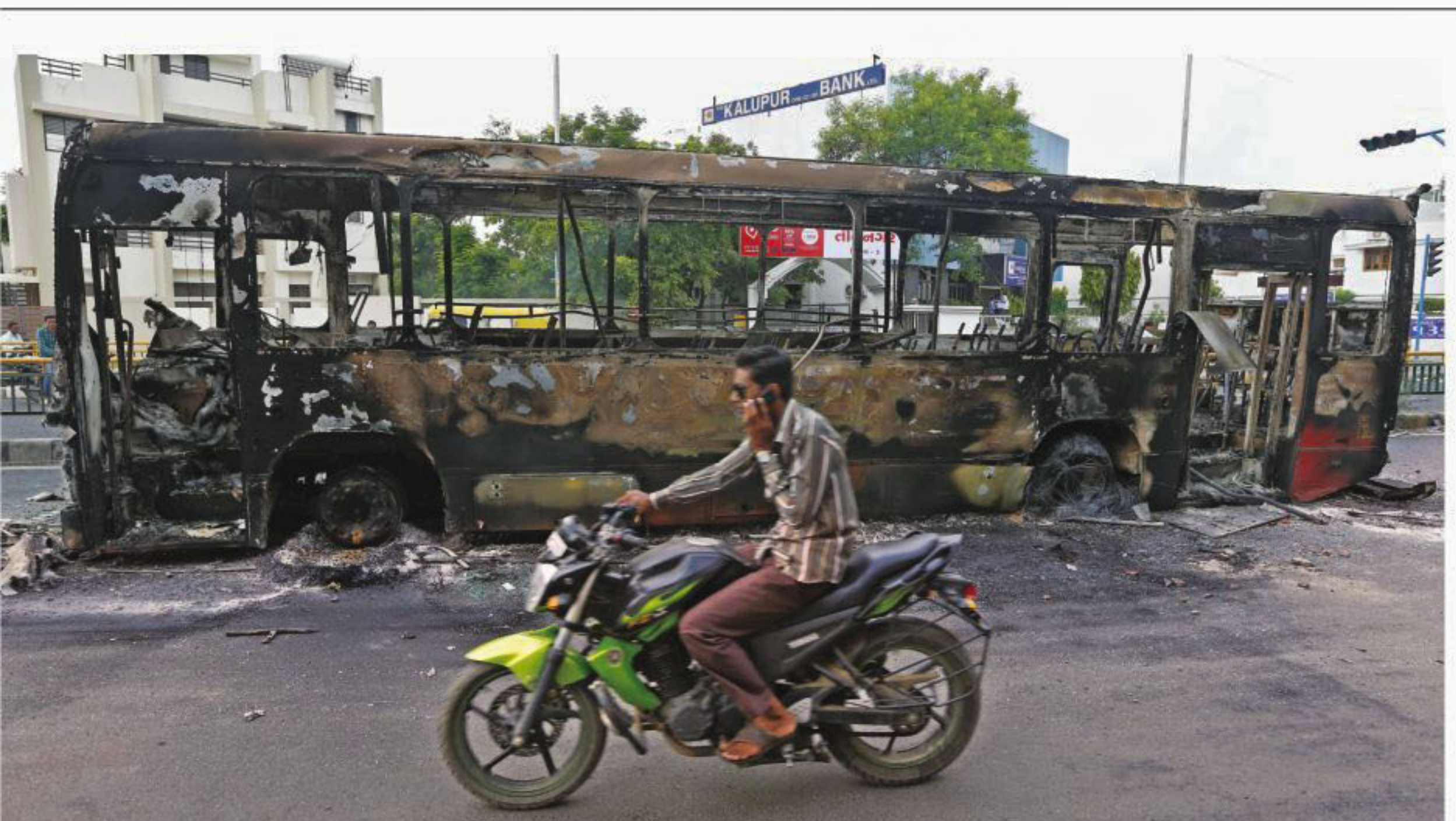
A man rides a motorcycle past the wreckage of a bus burnt during clashes between police and protesters in Ahmedabad, India yesterday. A curfew was imposed and paramilitary forces were deployed in the western state of Gujarat after violence broke out at a protest by a powerful clan to demand more government facilities.