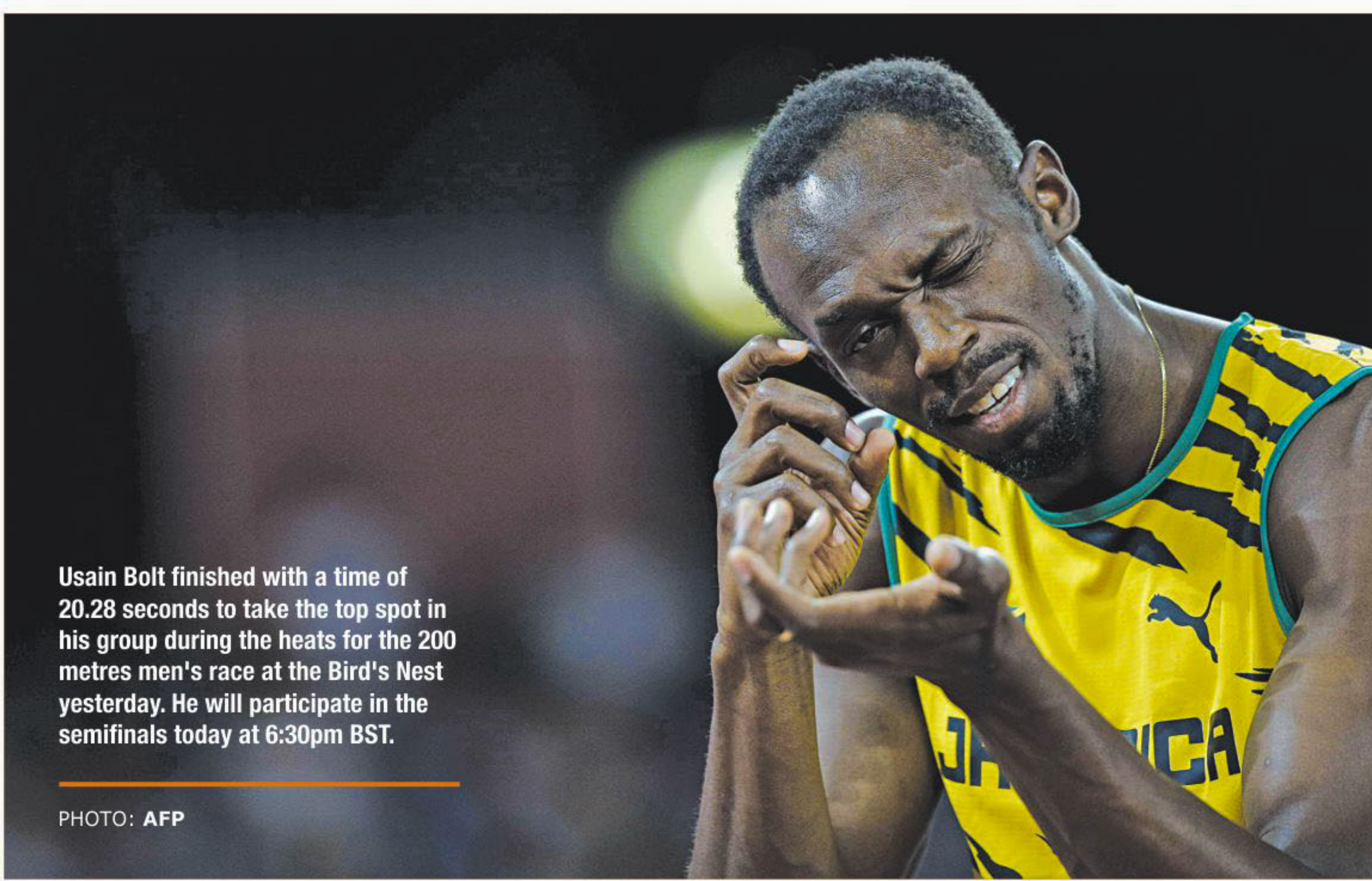
Usain Bolt finished with a time of 20.28 seconds to take the top spot in his group during the heats for the 200 metres men's race at the Bird's Nest yesterday. He will participate in the semifinals today at 6:30pm BST.

The 200m final takes place on Thursday at the Bird's Nest stadium.