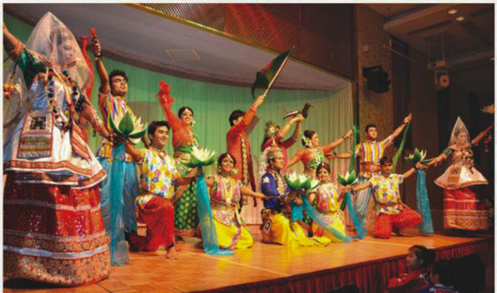
The dancers perform at the festival.