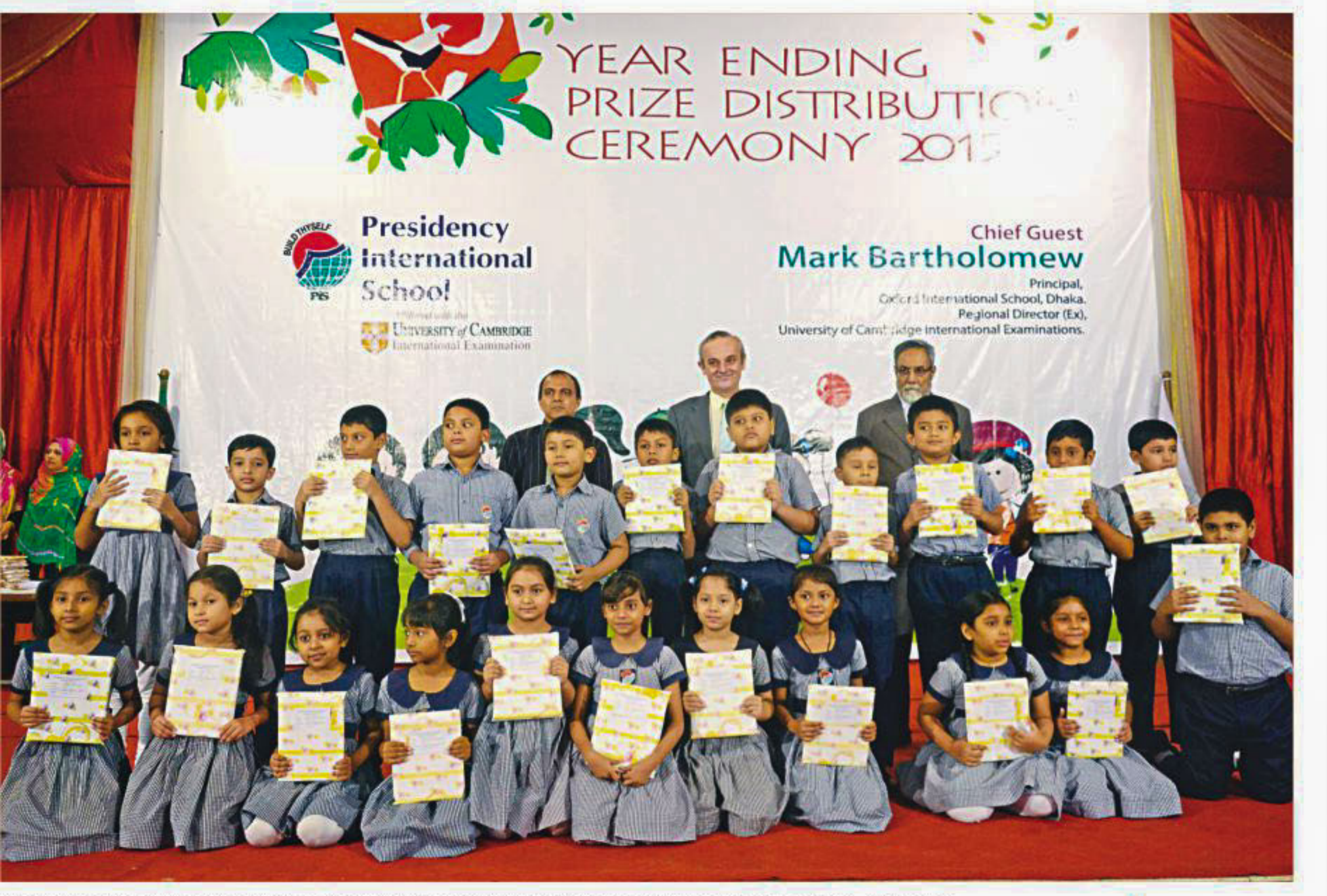
Guests and students of Presidency International School at the school's year-end and prize giving ceremony held at the Institute of Engineers, Chittagong yesterday.