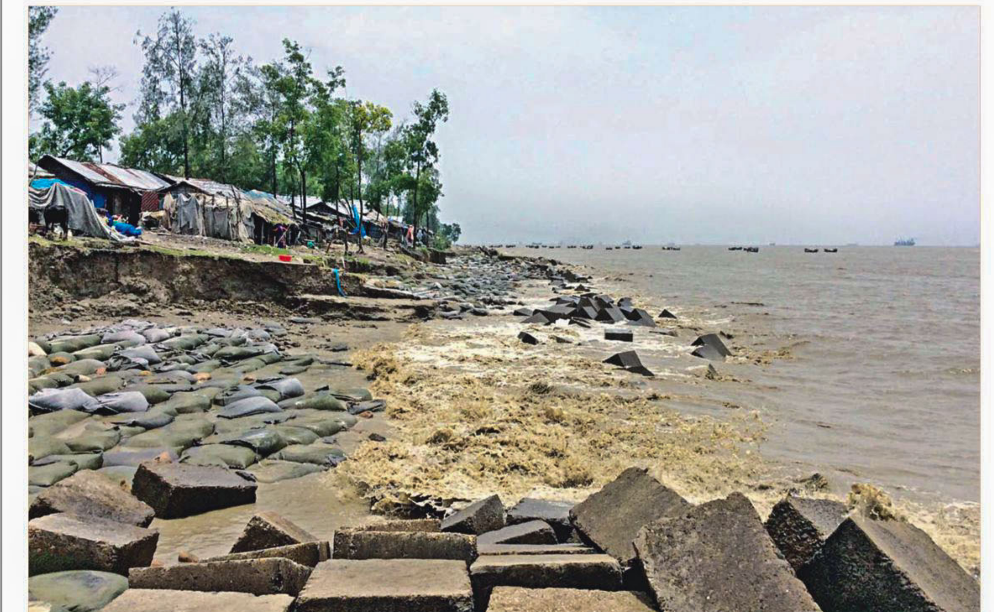
The crumbling Chittagong city protection embankment in Patenga recently. The structure is not holding against strong tidal surges and its current state spells disaster for some 2.5 lakh people and major industrial settlements.