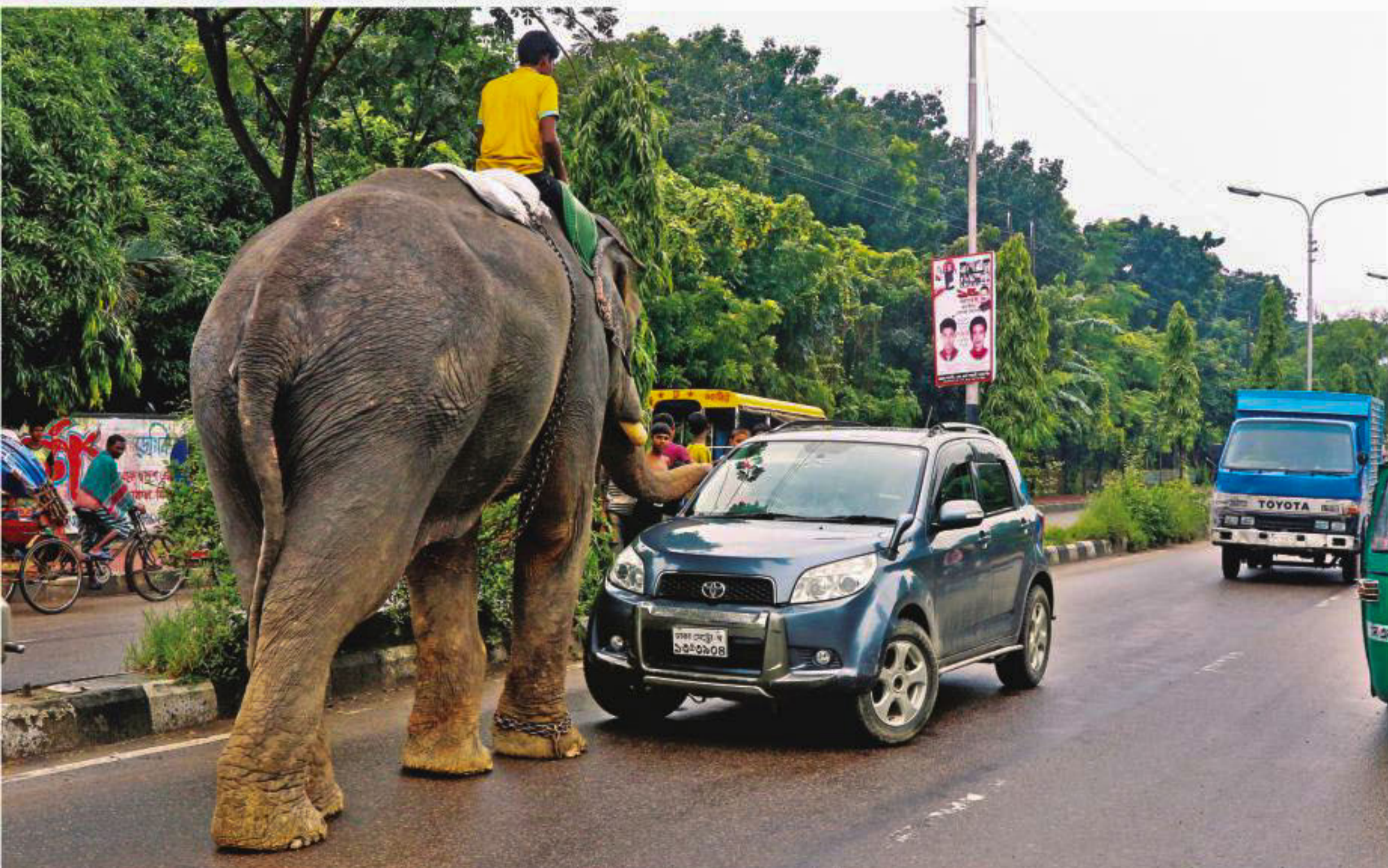
An elephant stops a car to extort from the driver at Agargaon in the capital on Friday. The use of elephant for extortion continues to annoy people in the city in the absence of any noticeable action from law enforcers though it has been covered by the media on many occasions.