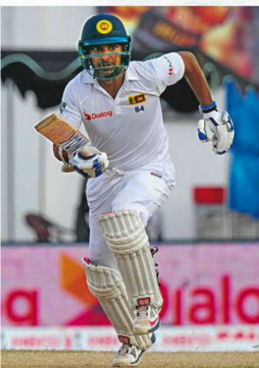
RUNNING INTO RETIREMENT: Legendary Sri Lanka batsman Kumar Sangakkara takes a single during his final knock of 18 on the fourth day of the second Test against India in Colombo on Sunday.