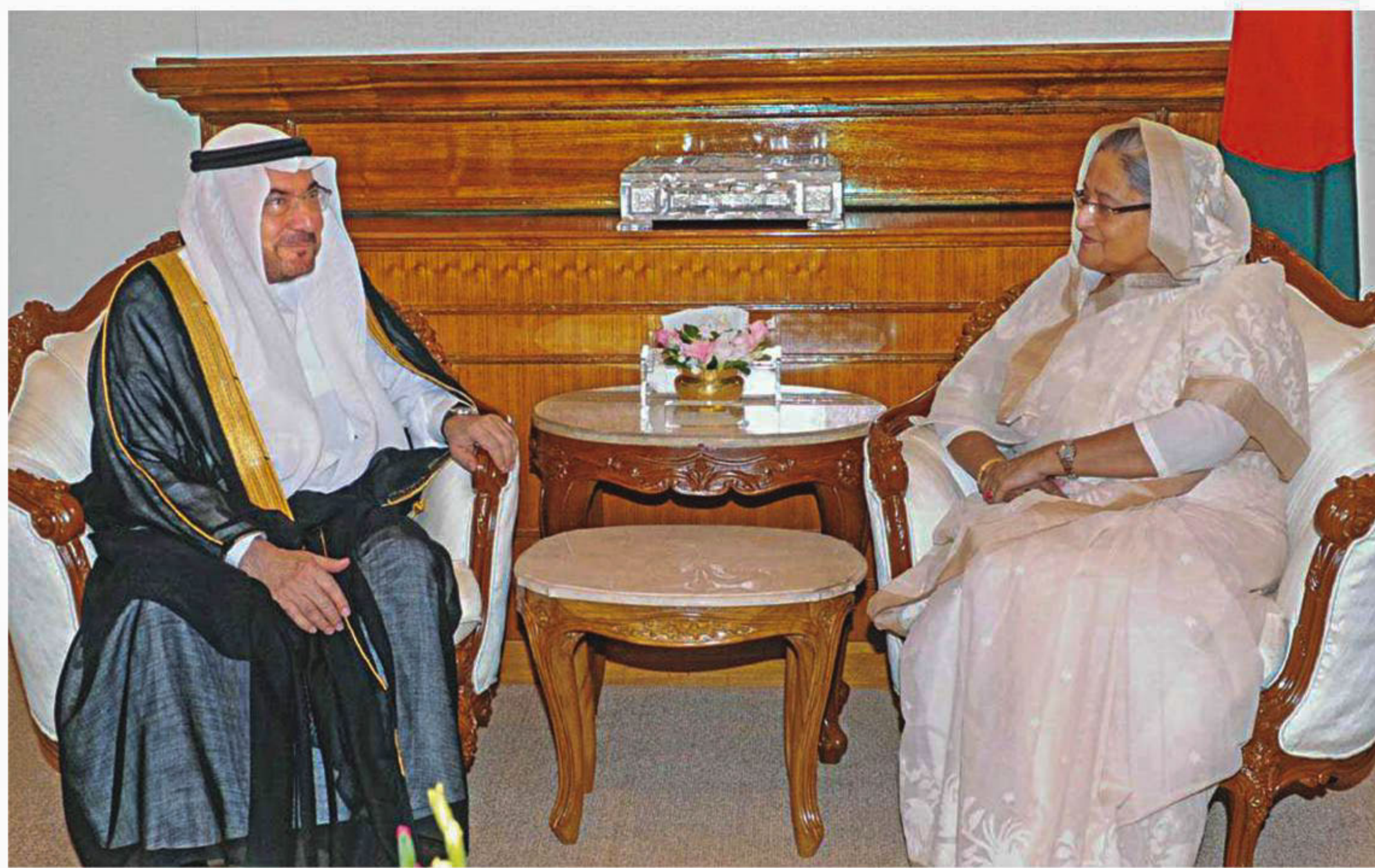
OIC Secretary General Iyad bin Amin Madani calls on Prime Minister Sheikh Hasina at the latter's office yesterday.