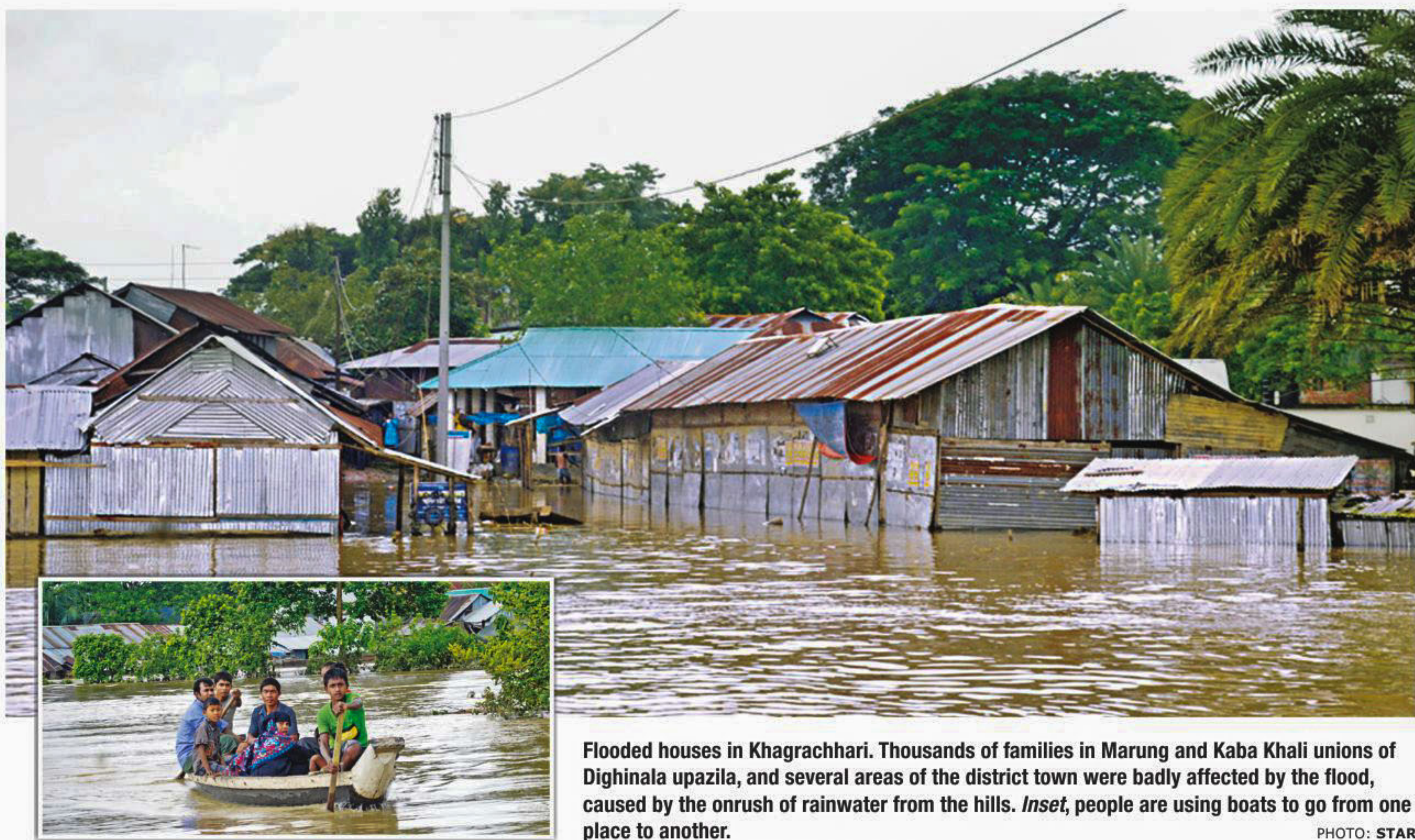
Flooded houses in Khagrachhari. Thousands of families in Marung and Kaba Khali unions of Dighinala upazila, and several areas of the district town were badly affected by the flood, caused by the onrush of rainwater from the hills. Inset , people are using boats to go from one place to another.