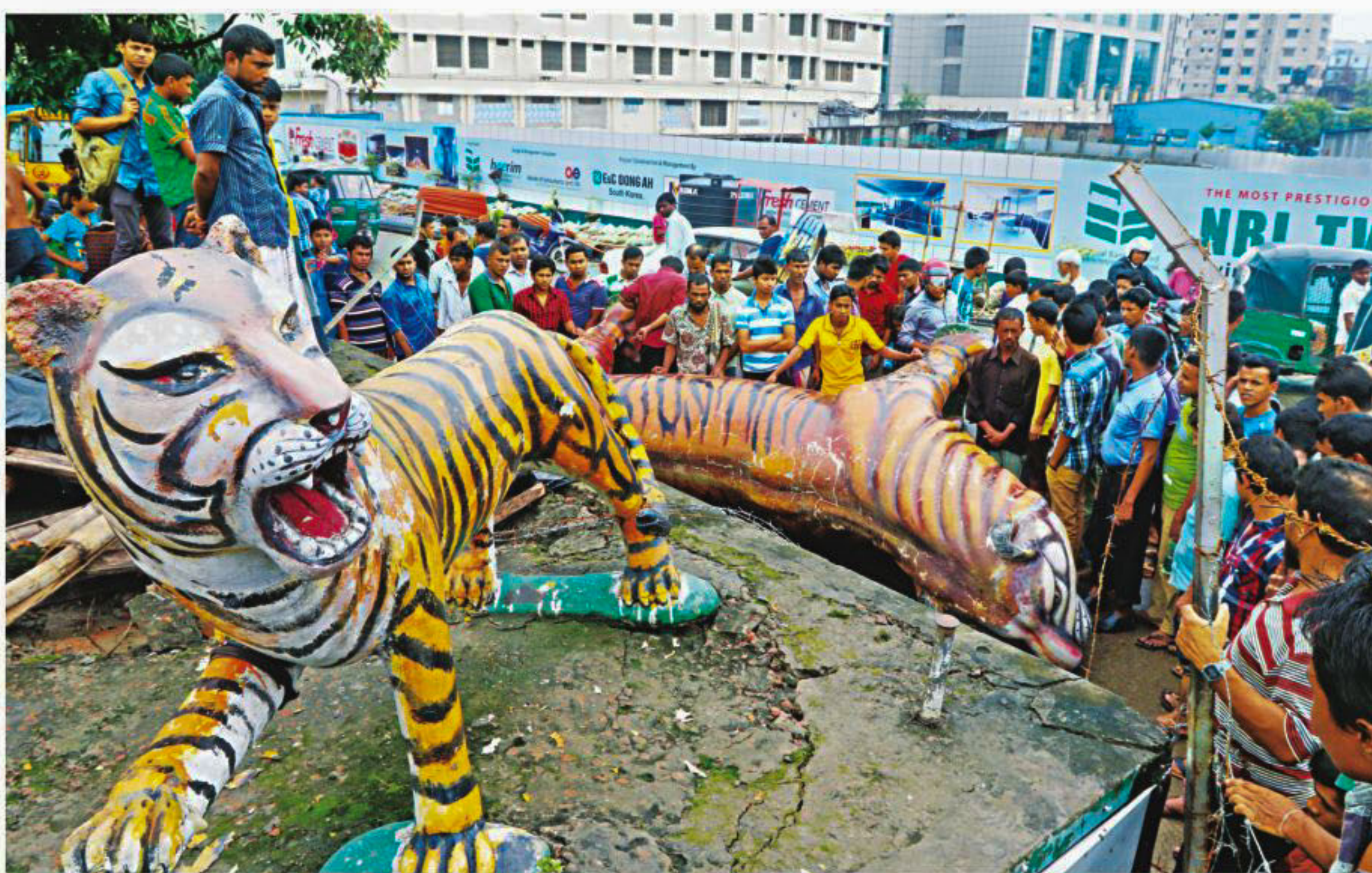
One of the two tiger statues at the capital's Sonargaon intersection fell on the road early yesterday, killing a man who was sleeping underneath.