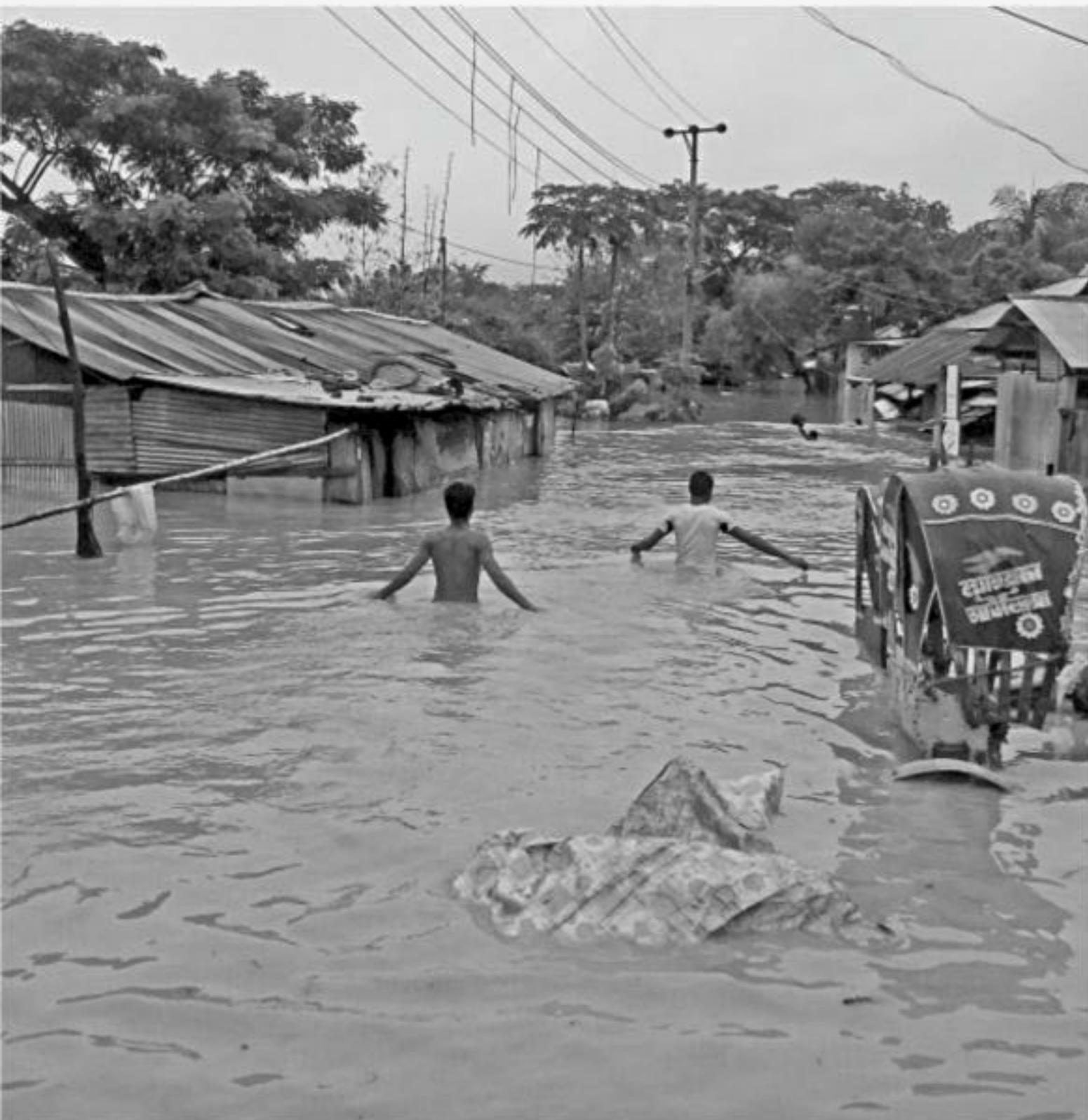
Like many other areas, Muslimpara of Khagrachhari district town and Tengargaon village in Noarai union of Chhatak upazila in Sunamganj district go under as flood situation worsened further amid heavy rainfall yesterday.