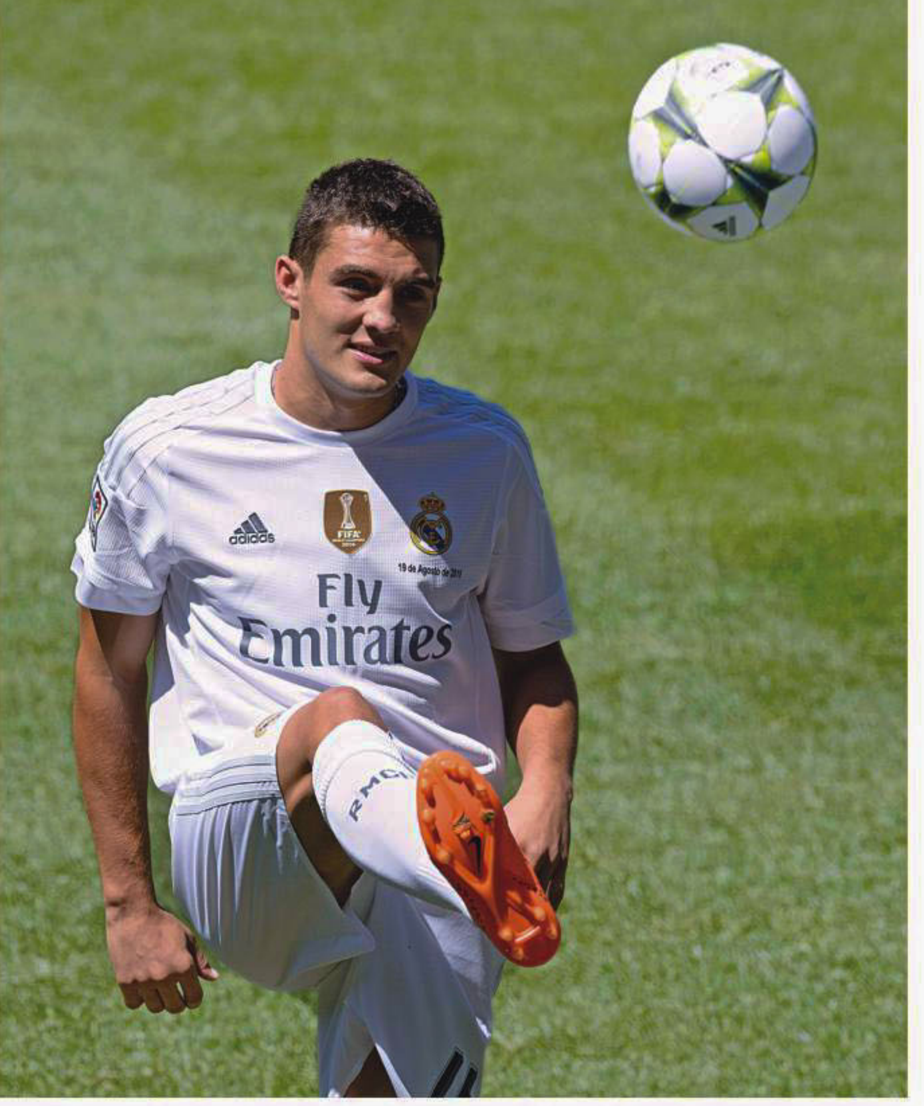
Real Madrid's latest signing Croatian midfielder Mateo Kovacic kicks the ball during his official presentation at the Bernabeu yesterday.

that clipped the bar before Bulut passed up a great chance to equalise when he blazed over from barely three yards out. Gareth Bale endured another largely frustrating night as he too failed to find the target with an effort from distance and was met with boos from sections of the home support. And even Cristiano Ronaldo's eye for goal was awry as the World Player of the Year spooned a glorious opportunity over from Jese Rodriguez's fine cut-back with the last action of the first-half. Madrid were made to pay for that miss early in the second period when Sneijder levelled against his former side with a fine left-footed strike into the far corner. Navas saved Benitez the embarrassment of going behind on his home debut with a stunning save from Sabri Sarioglu moments later. Both sides then made a raft of substitutions, but there was one moment of real quality left to decide the game as Marcelo skipped past three Galatasaray defenders before prodding the ball home at the near post. Meanwhile Croatian international midfielder Mateo Kovacic has joined Real Madrid from Inter Milan on a six-year deal, the Spanish giants confirmed on Tuesday. "Real Madrid and Inter Milan have agreed the transfer of Mateo Kovacic, who will be tied to the club for the next six seasons," Madrid said in a statement. According to reports in the Spanish media the 10-time European champions