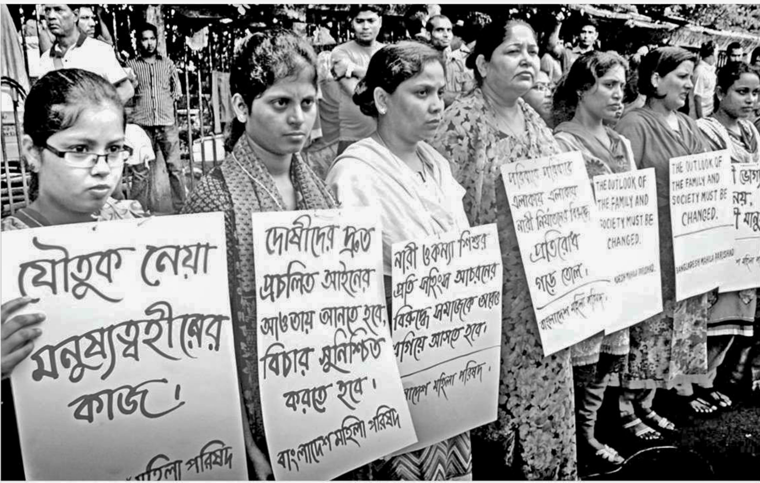
Bangladesh Mahila Parishad organises a human chain in front of Jatiya Press Club in the capital yesterday protesting violence against women and children.