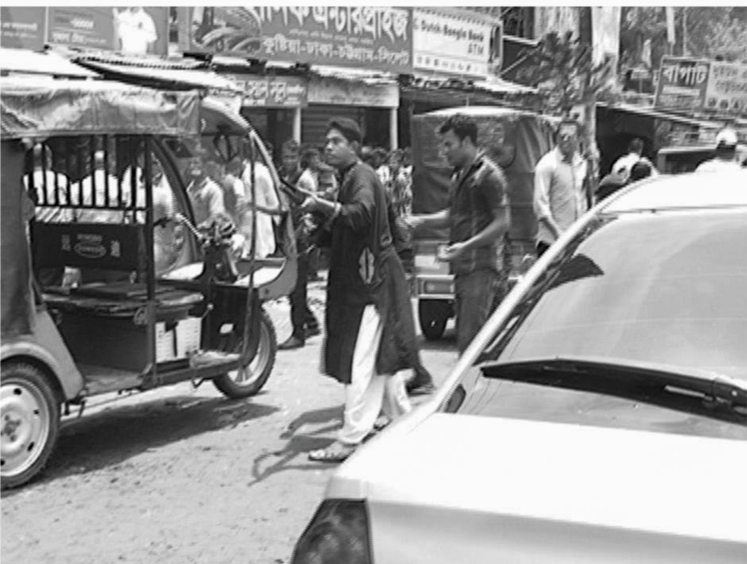
A scene during the bloody clash between two groups of pro-ruling party men that left one killed and 30 others injured in Kushtia town yesterday.

No case was filed in this connection as of 5:00pm yesterday, the OC added.