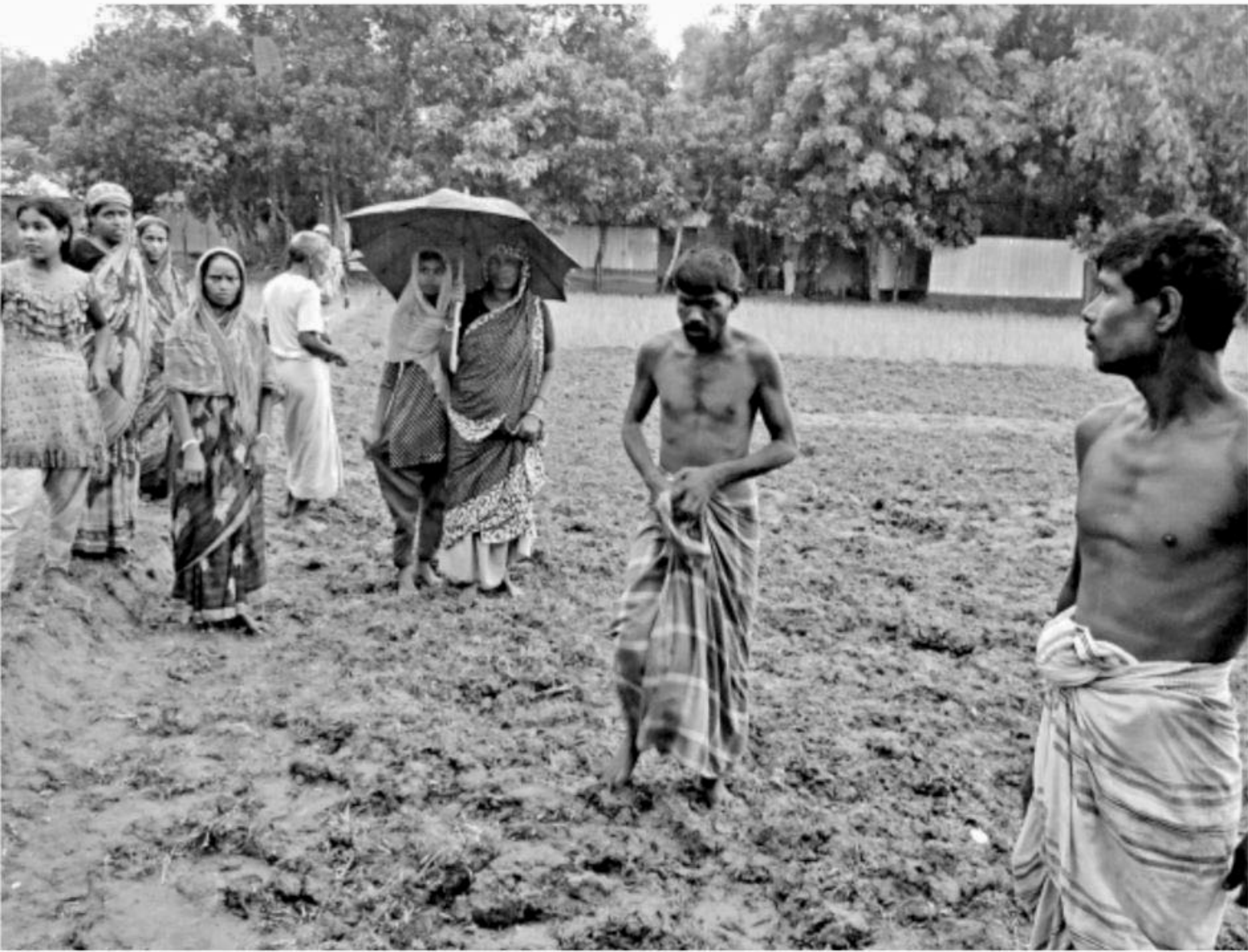
A gang's attempt to forcibly occupy this piece of land belonging to a Hindu family at Ananda Bazar village in Lalmonirhat Sadar upazila was foiled, thanks to the initiative of the fellow villagers who arranged guarding there from midnight to morning yesterday.