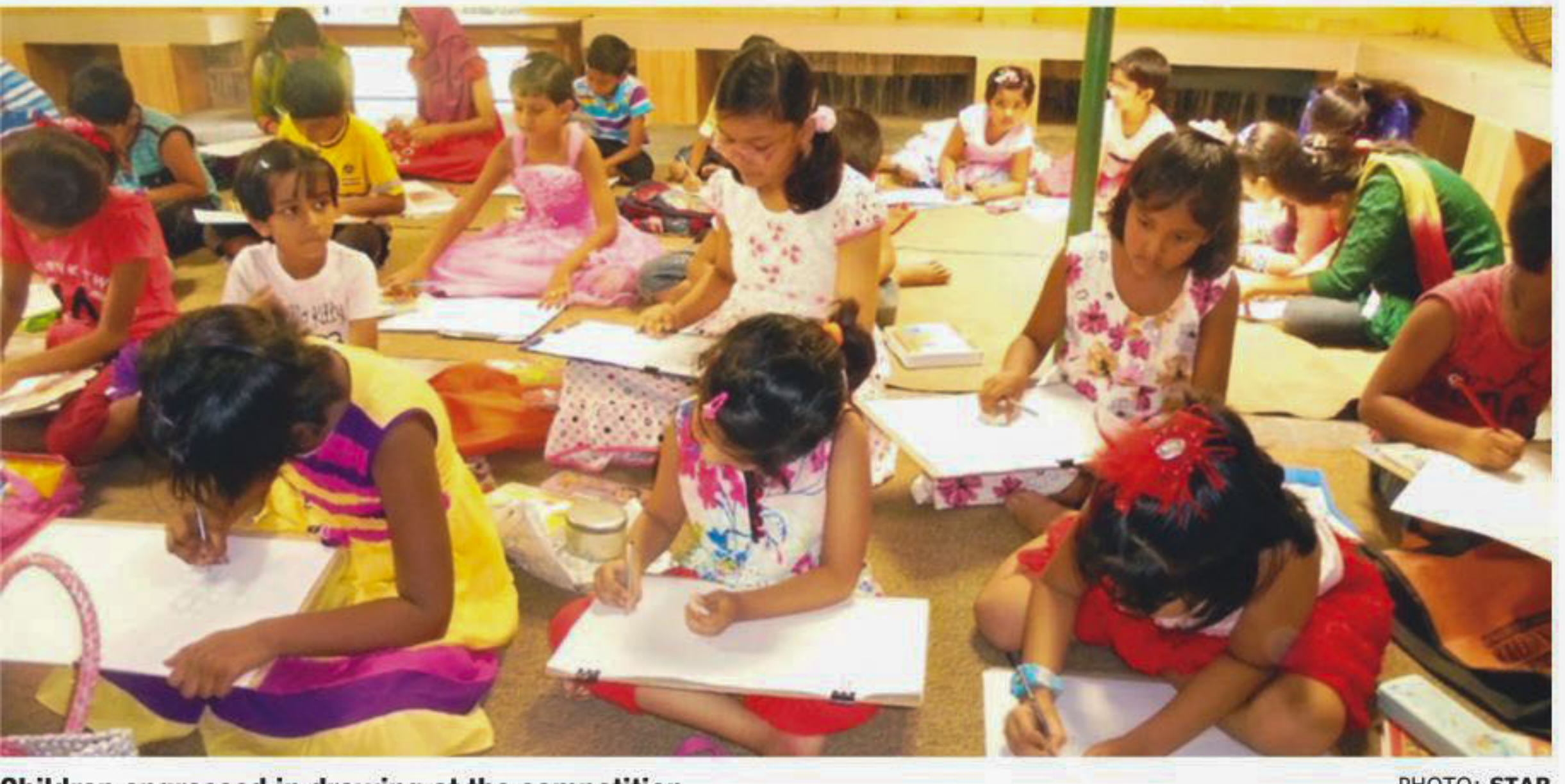
Children engrossed in drawing at the competition.