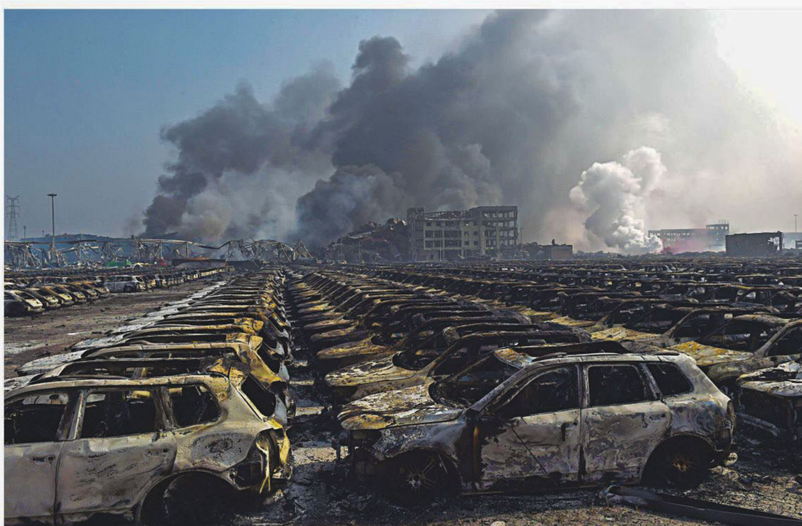
Charred cars lie in rows and smoke rises over burnt buildings at the site of yesterday's massive explosions in Tianjin port of China that killed at least 50 people. Story on page 20.

The amount of time Mahmudur had already spent in jail in connection with the case would be deducted from the SEE PAGE 2 COL 1