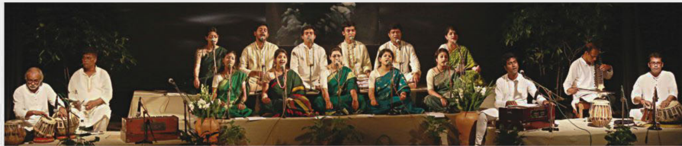
Artistes perform a chorus at Chhayanaut.