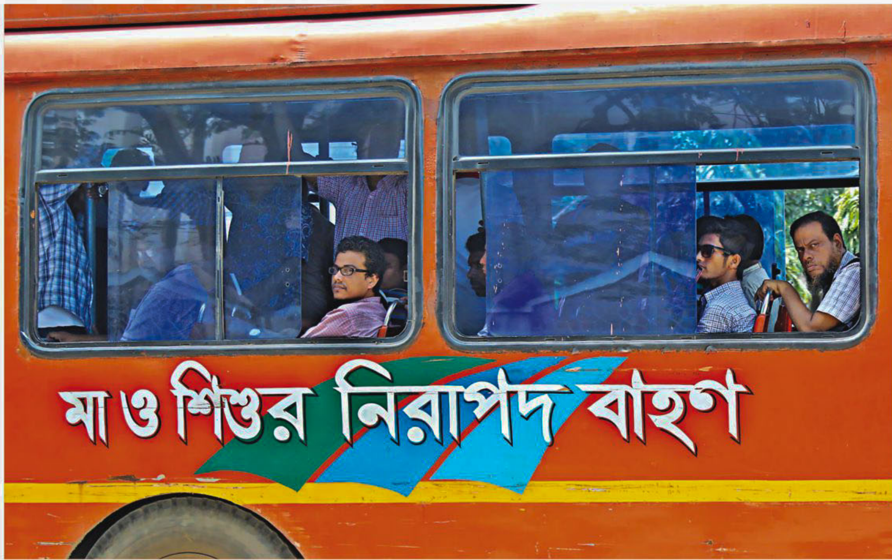
A bus meant only for women and children is crowded by male passengers at Lalkhan Bazar in Chittagong city yesterday.