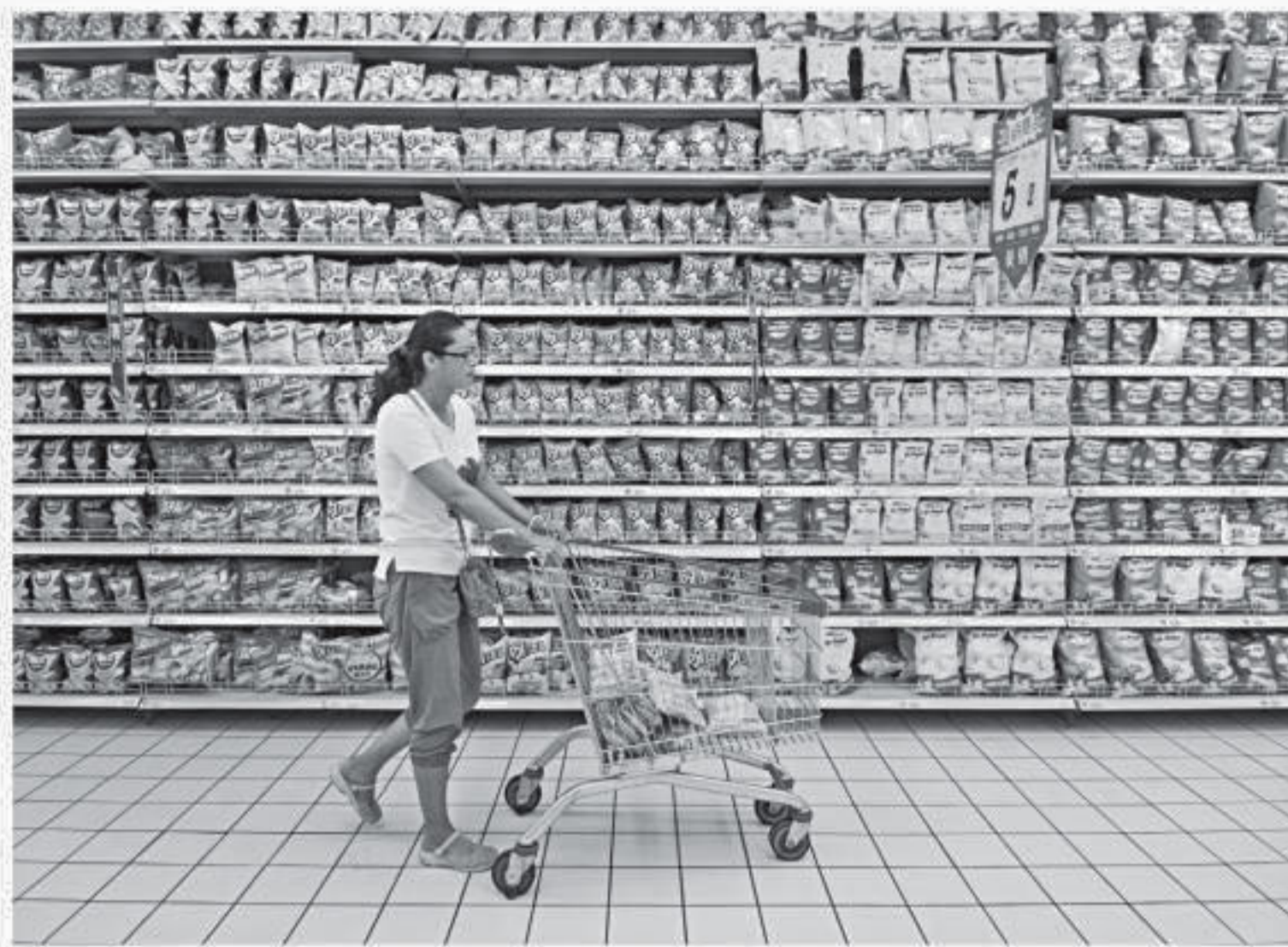
A customer pushes a cart at a supermarket in Anhui province, China.

The world's second-largest economy is officially targeted to grow at 7 percent this year, still strong by global standards, but