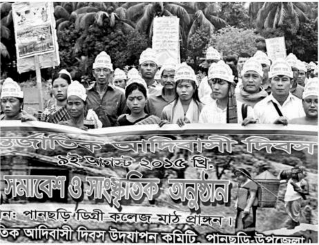
Indigenous people bring out a colourful procession in Panchhari upazila of Khagrachhari district marking International Day of the World's Indigenous People yesterday, left, and Garo artistes performing their traditional cultural functions at the premises of Corpus Christi High School in Madhupur upazila under Tangail district offer a captivating sight the same day.