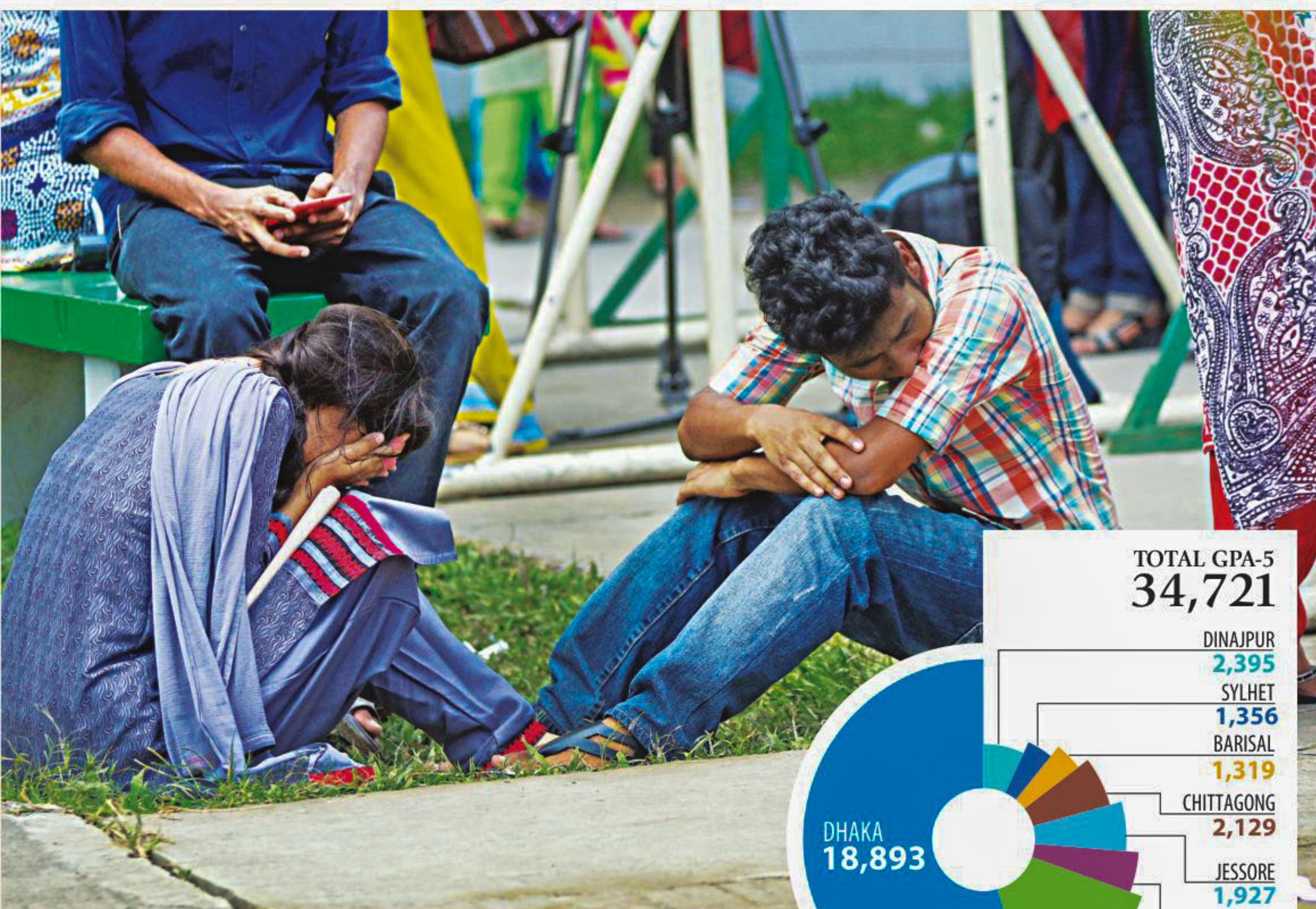
Two students of Rajuk Uttara Model College sit dejected after narrowly missing out on GPA-5 in their HSC exams. The results of the test were out yesterday.