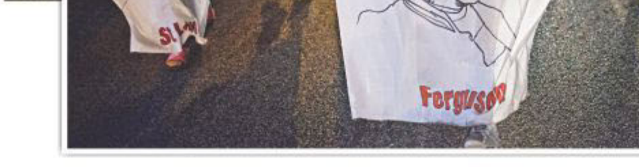
Demonstrators protest in front of the police station to mark the first anniversary of the death of Michael Brown in Ferguson, Missouri. Brown, an unarmed black teenager, was shot and killed by a Ferguson police officer on August 9, 2014. Brown's death sparked months of sometimes violent protests in Ferguson and drew nationwide focus on police treatment of black offenders.