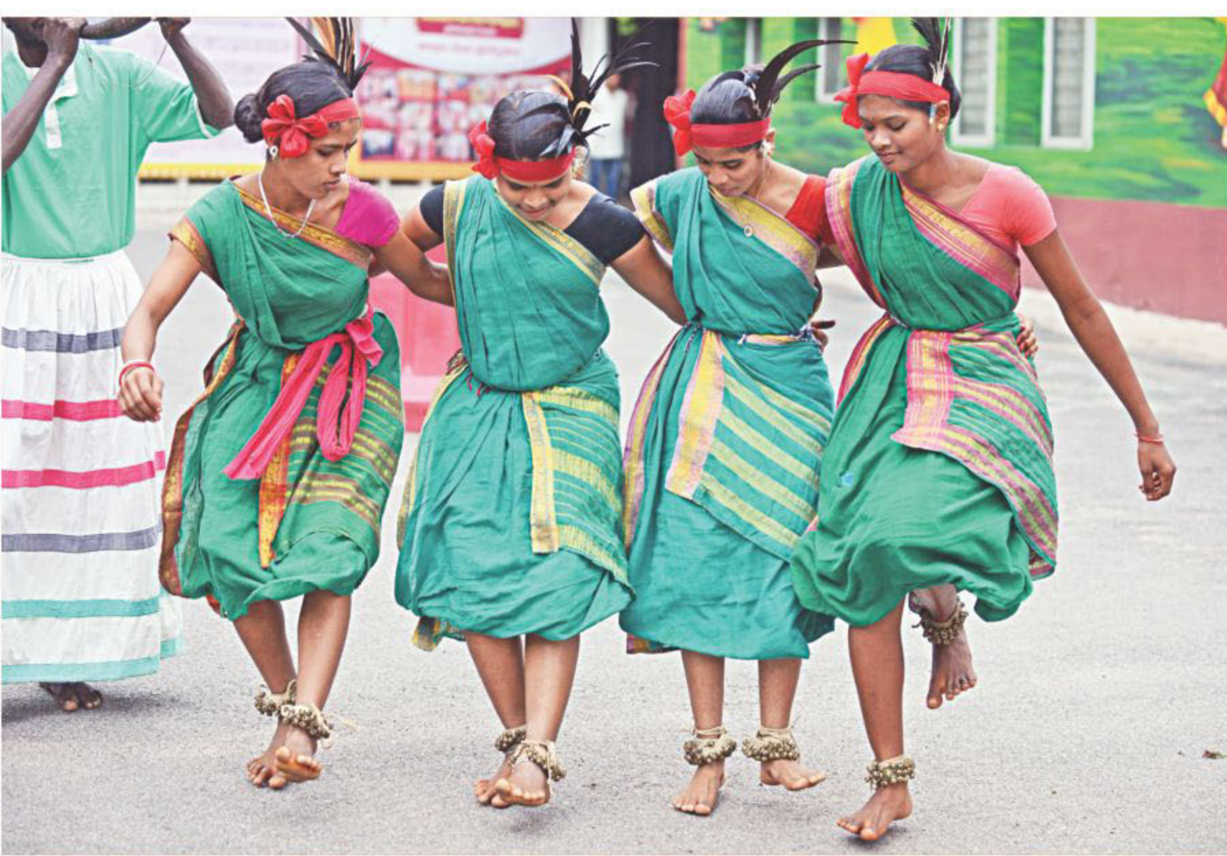
Indian women dance at a tribal performance in Hyderabad on the eve of International Day of the World's Indigenous Peoples yesterday. The International Day of the World's Indigenous Peoples is observed on August 9 each year.