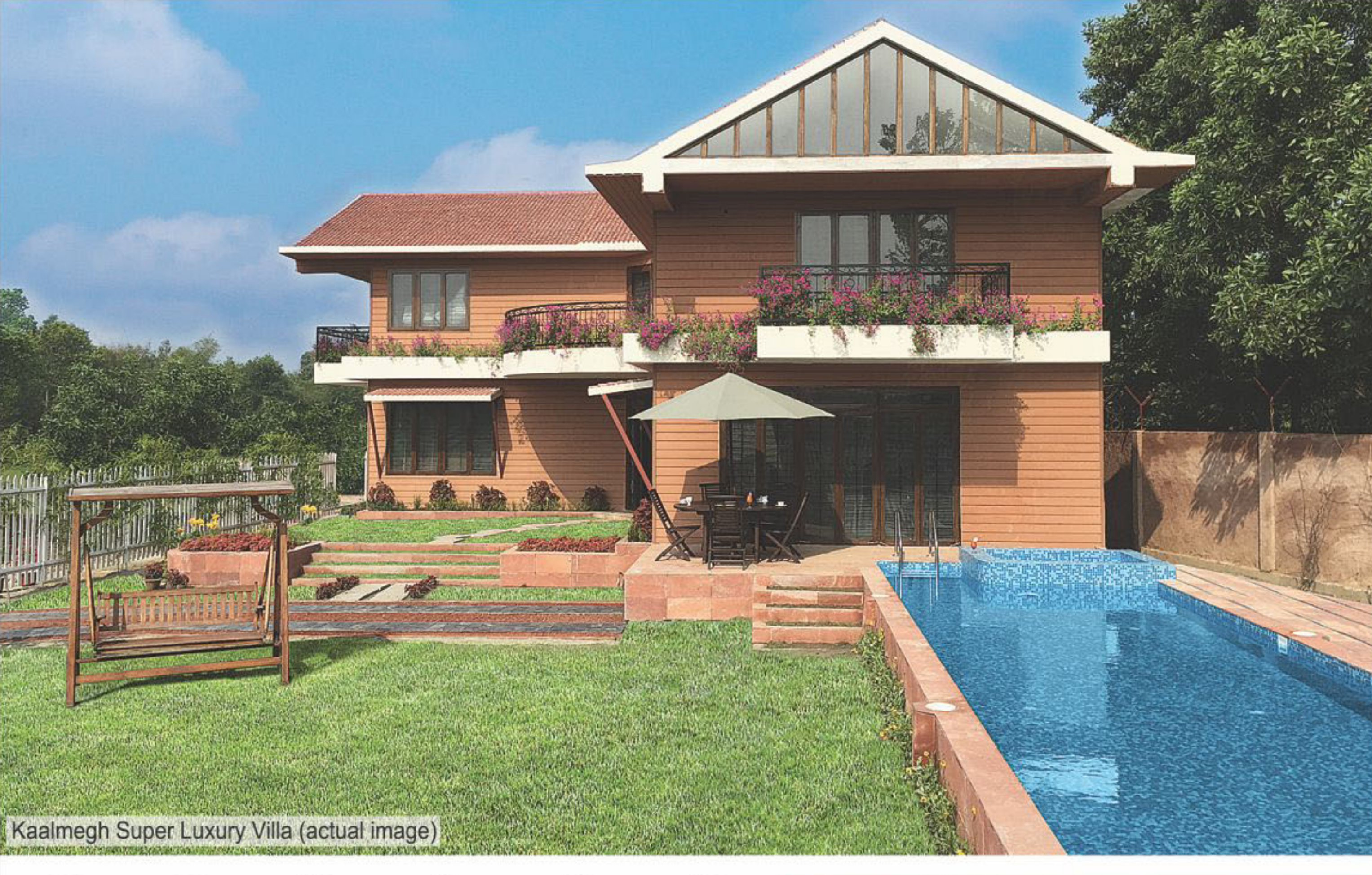
Kaalmegh Super Luxury Villa (actual image)