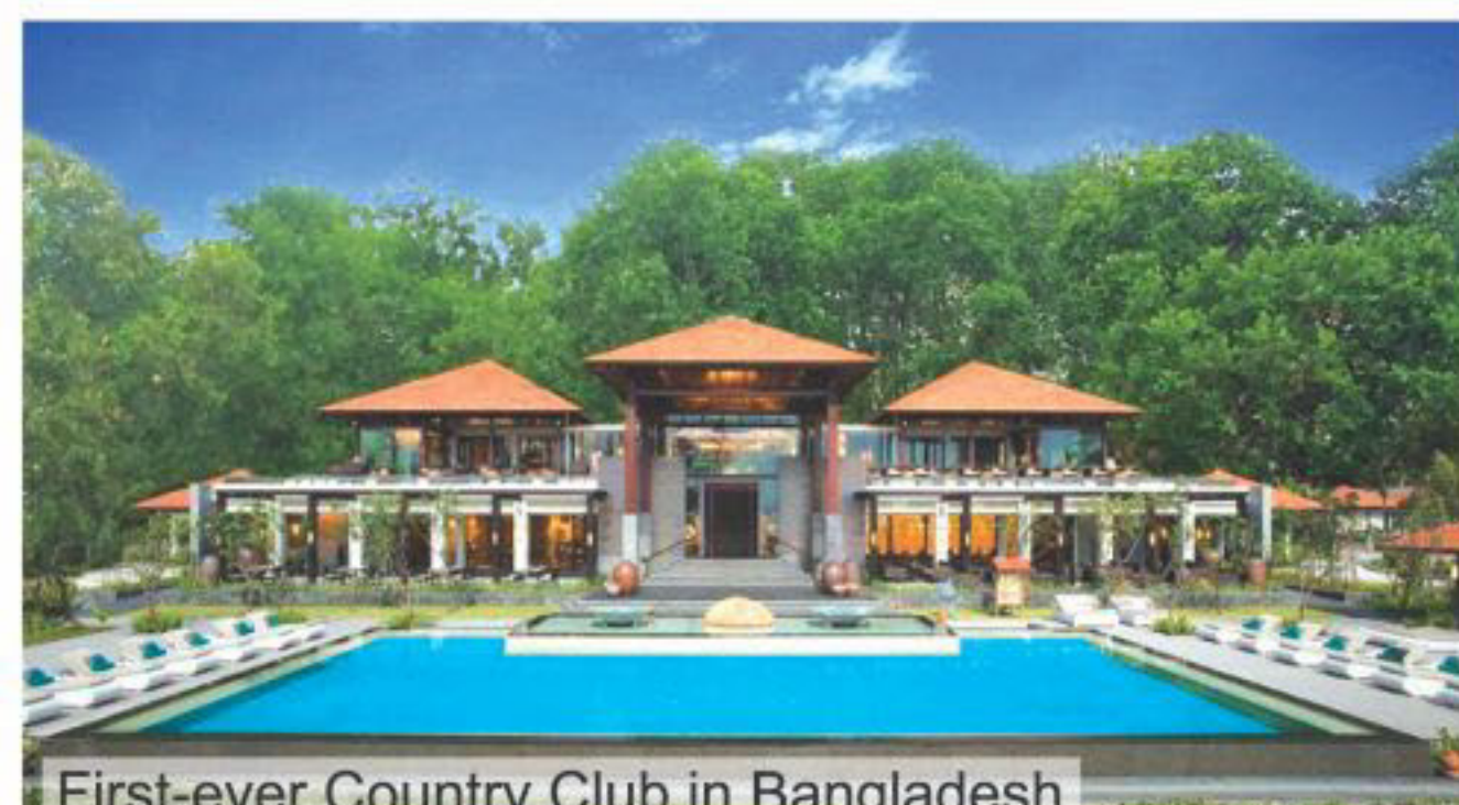
First-ever Country Club in Bangladesh