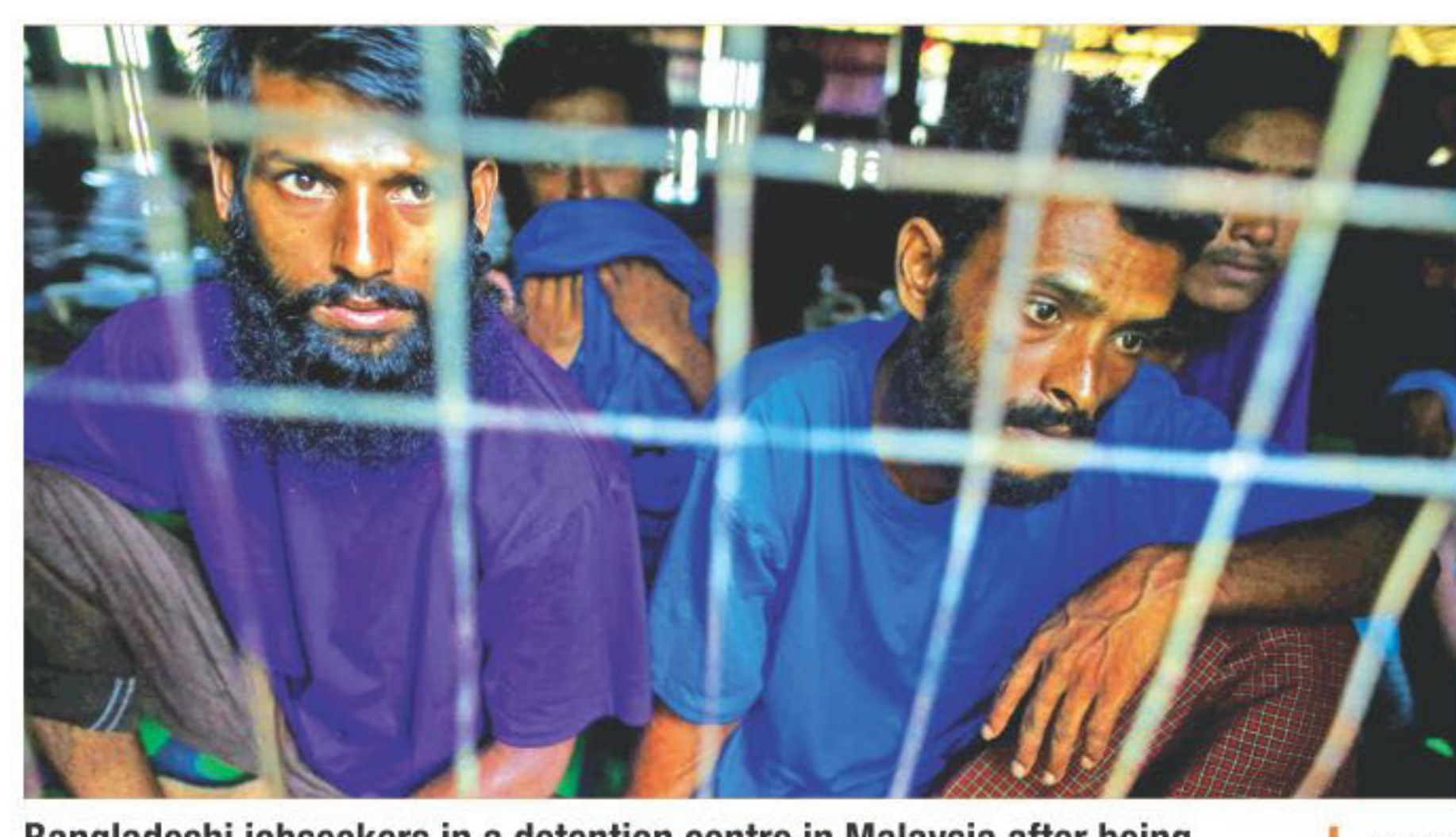
Bangladeshi jobseekers in a detention centre in Malaysia after being rescued from the sea in May.