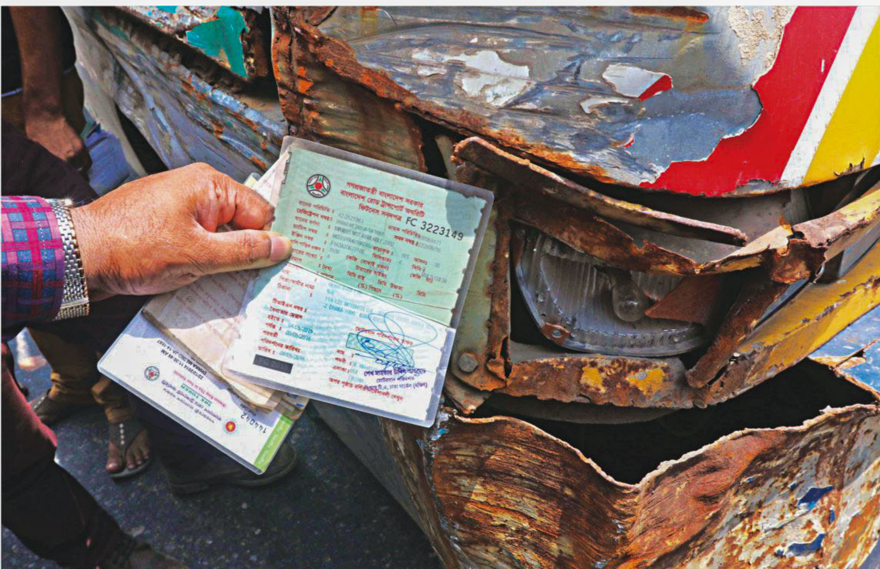
This bus has a fitness certificate, even though its indicator light is broken and it has heavy dents on its body. It had no wipers either. However, during a drive against unfit vehicles yesterday, a Dhaka Metropolitan Police mobile court stopped it at Shanir Akhra near the capital and had it impounded.

"You all have to remain careful so that the image of Bangabandhu is not