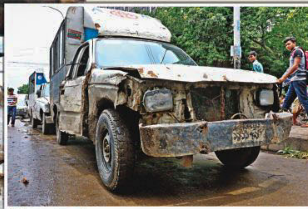
A headlight bulb sticks out of where the lens should be in a human haulier, left, as a man tries to fix the engine of the rundown vehicle. Another human haulier, top, that is in worse shape than jelpies seen in Looney Tunes. A rope, bottom, is used for keeping the driver's door of another vehicle closed. The photos of the vehicles, which run between Mugdha and Motijheel, were taken recently.