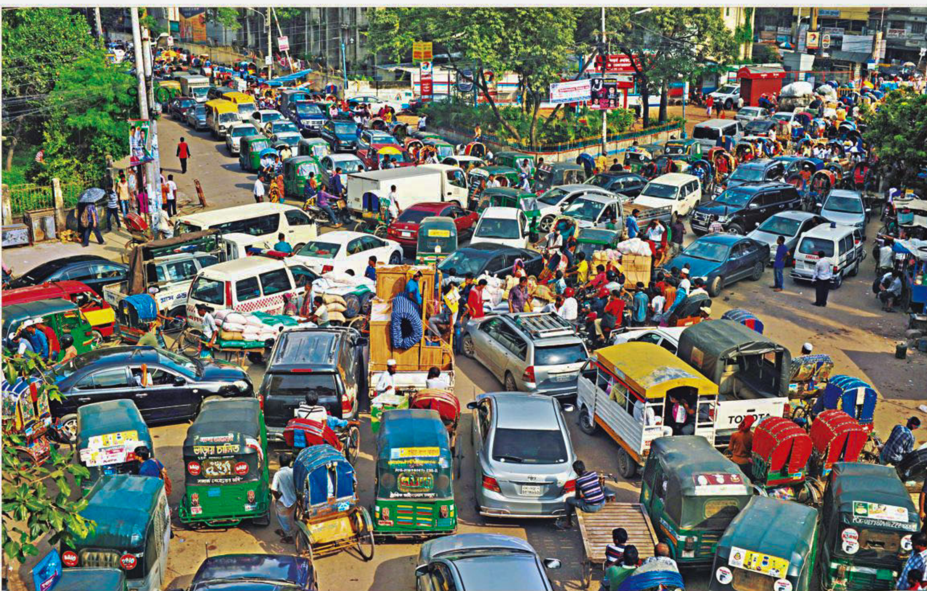
Traffic chaos at the Shahidullah Hall intersection near Chankharpool in the capital yesterday afternoon after processions crossed the area to join a discussion at Suhrawardy Udyan. Dhaka South City Corporation organised the programme to mark the 40th death anniversary of Father of the Nation Bangabandhu Sheikh Mujibur Rahman.