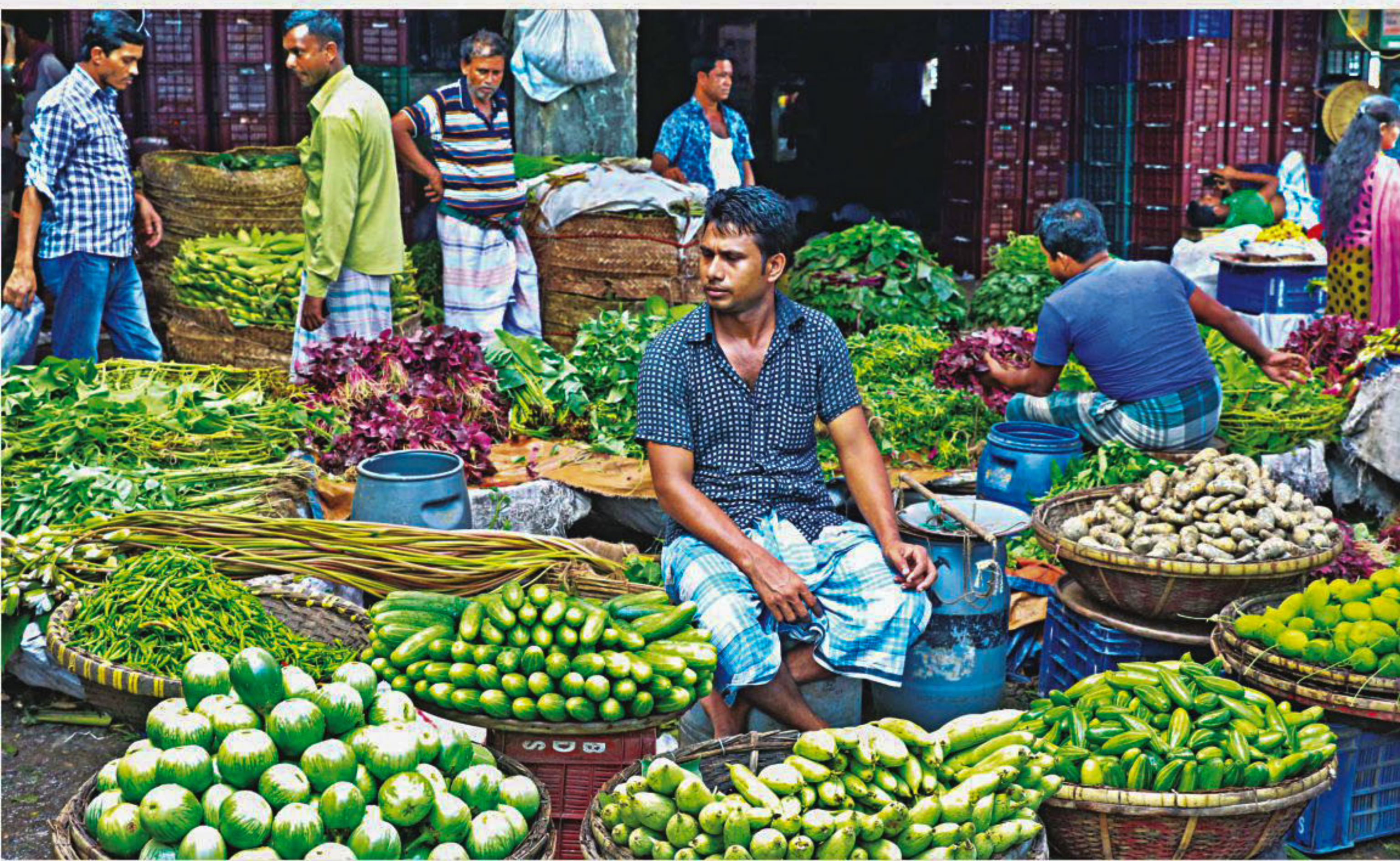
A vegetable trader waits for customers at Karwanbazar kitchen market yesterday. Prices of vegetables have shot up at the capital's kitchen markets over the last few days. Traders blame it on supply dearth due to downpours and flooding in some districts.