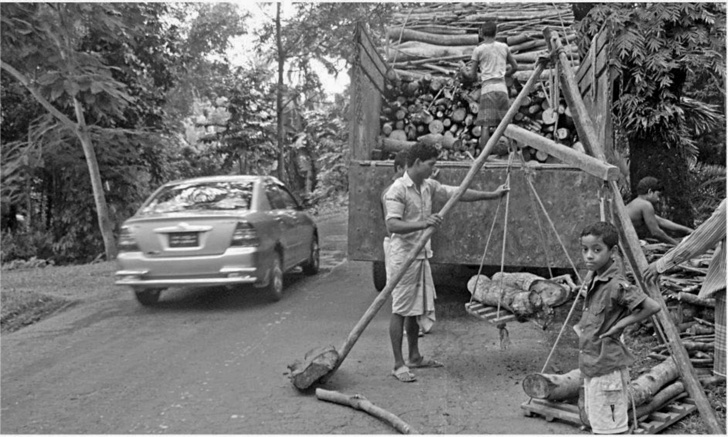
A section of callous traders use different places of Barisal-Khulna and Barisal-Patharghata highways to weigh firewood and load it onto trucks, hampering vehicular movement and raising the risk of accidents. The photo was taken from Bagri of Rajapur upazila under Jhalakathi district yesterday.