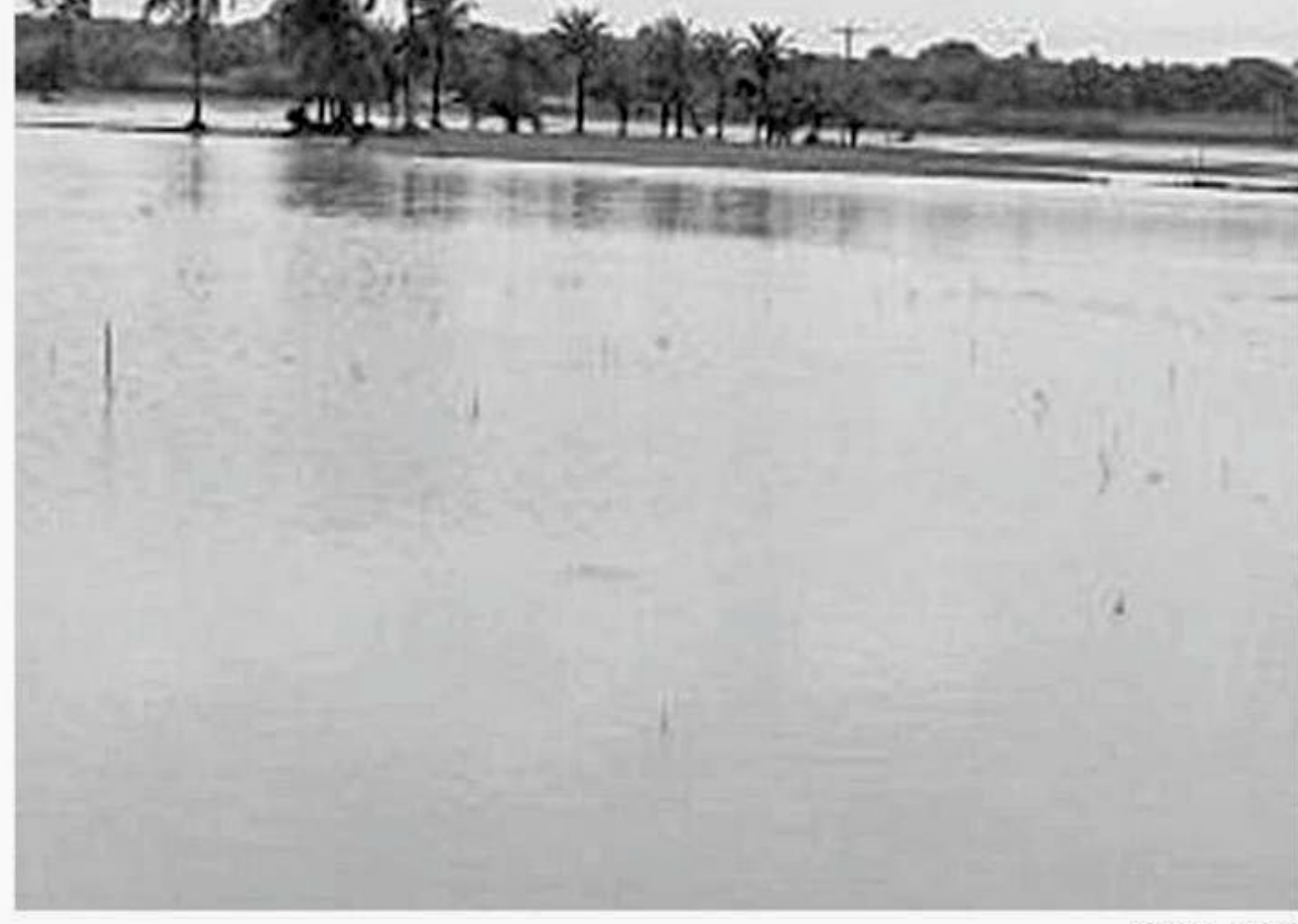
Vast areas under Benapole Land Port Police Station and Sharsha and Jhikargachha upazilas under Jessore district get flooded due to overflowing of Ichhamati and Kudla rivers following onrush of water from the upstream in India. The photo was taken from a village in Benapole area yesterday.