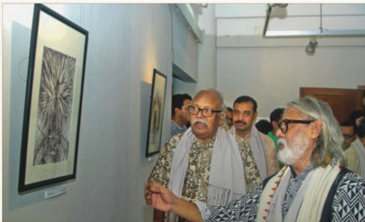
Artists and guests at the exhibition.

Fifty eight artworks -- most of them sketches in pen and ink -- are on display. Many of the paintings are depictions of the struggles of the struggle of the Liberation War and the people's expectation of speedy execution of war criminals. The slogans used in the Liberation War are used as