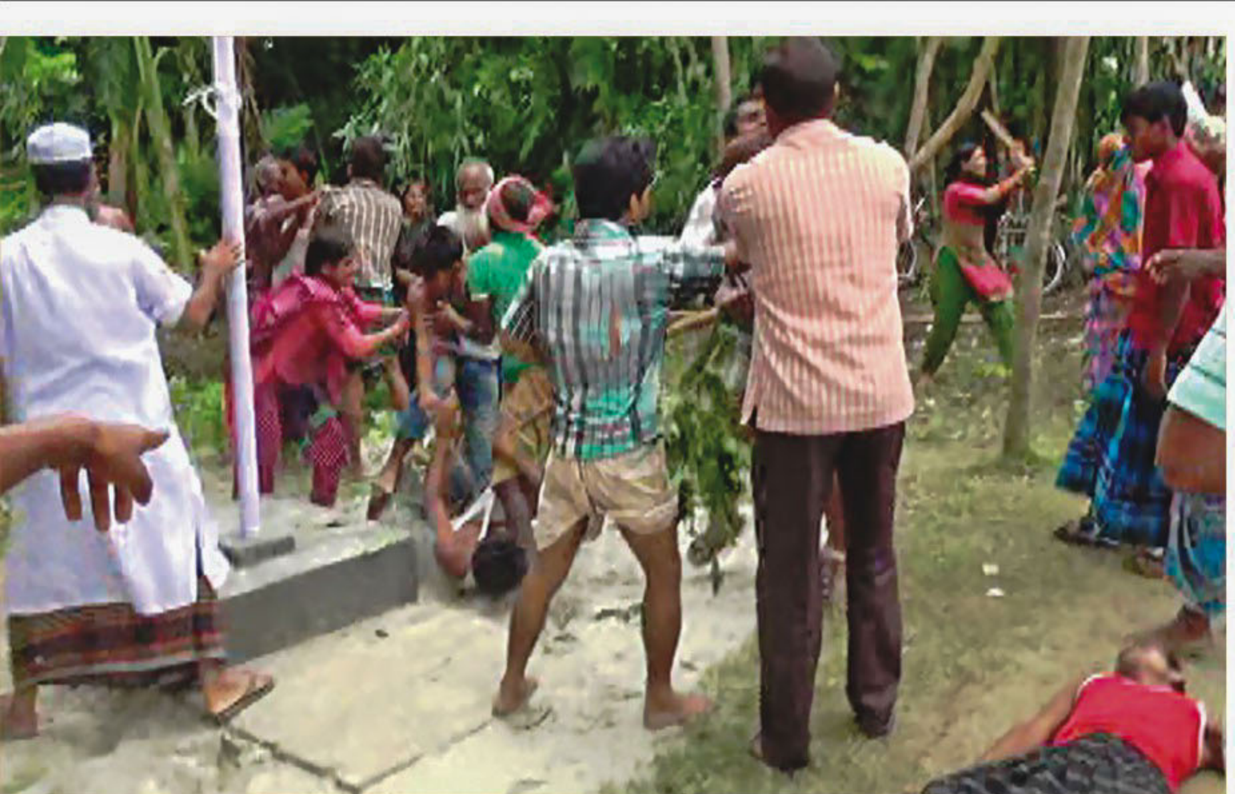
A clash yesterday between two groups of claimants of a land in Dashiarchhara of Kurigram's Phulbari upazila which became a part of Bangladesh in a historic enclave swap just a day before. At least 11 people were injured.