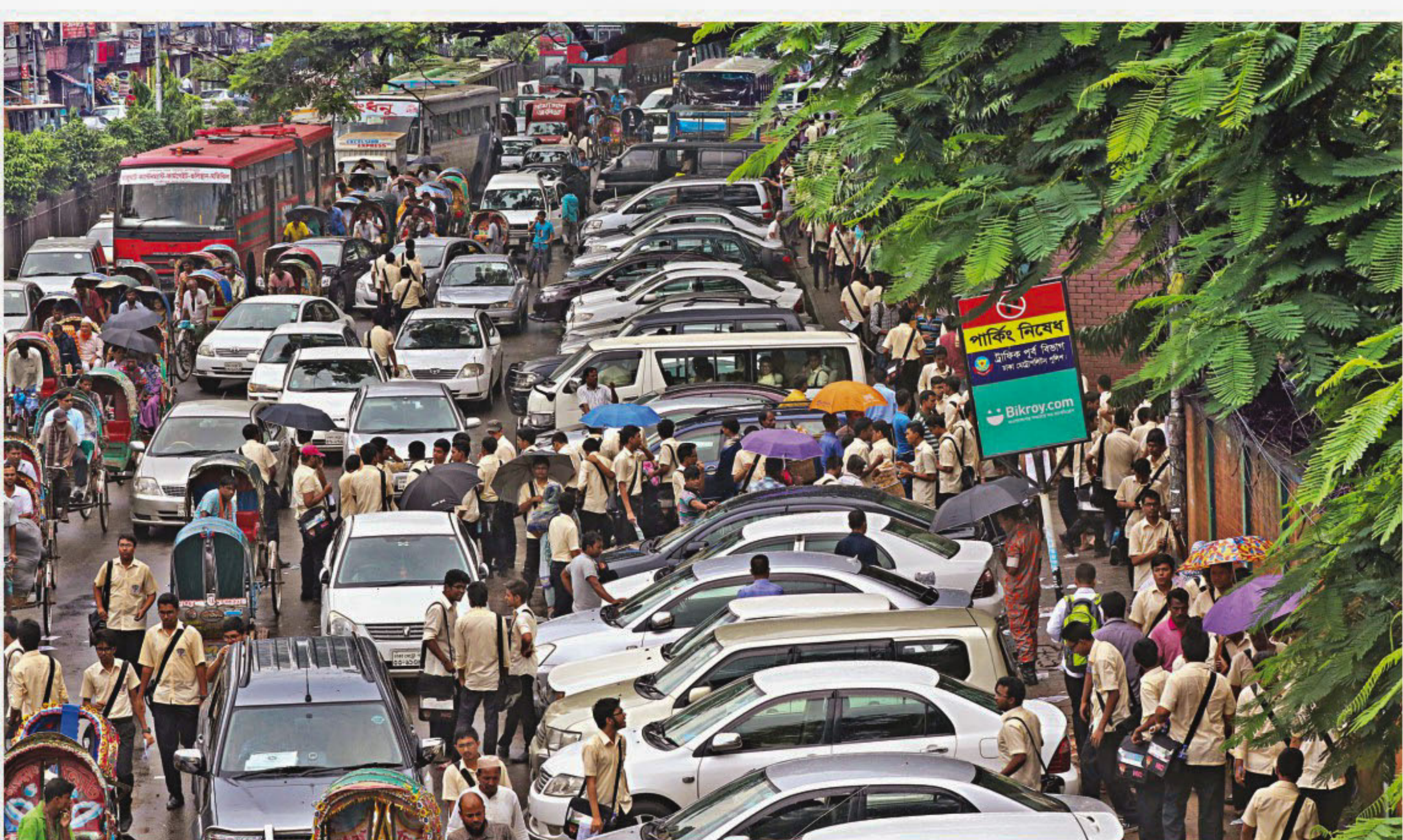
Cars parked, that too at a right angle to traffic on Toyenbee Circular Road, in front of the capital's Notre Dame College yesterday with complete disregard to a road traffic sign specifically barring the practice, and leading to gridlocks.

Of them, 17 surrendered before the Barisal metropolitan magistrate court and appealed for bail. The court, rejecting their bail prayers, ordered sending them to jail, court sources said.