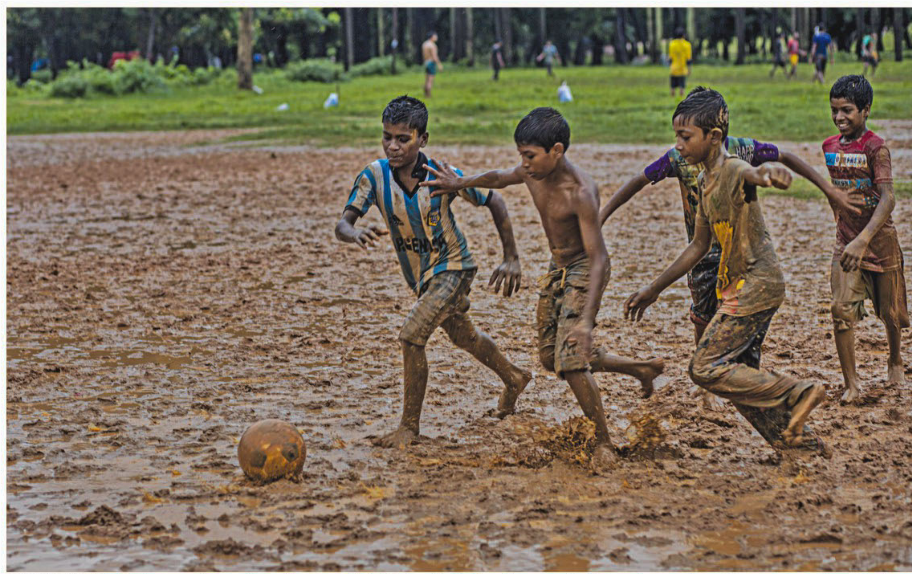
BLISS IN THE RAIN: There are times when all one needs in life is a football and an open field to rediscover love. The nonstop rain yesterday might have brought plight to many, but it gave just that love to these tiny tots at the Suhrawardy Udyan.