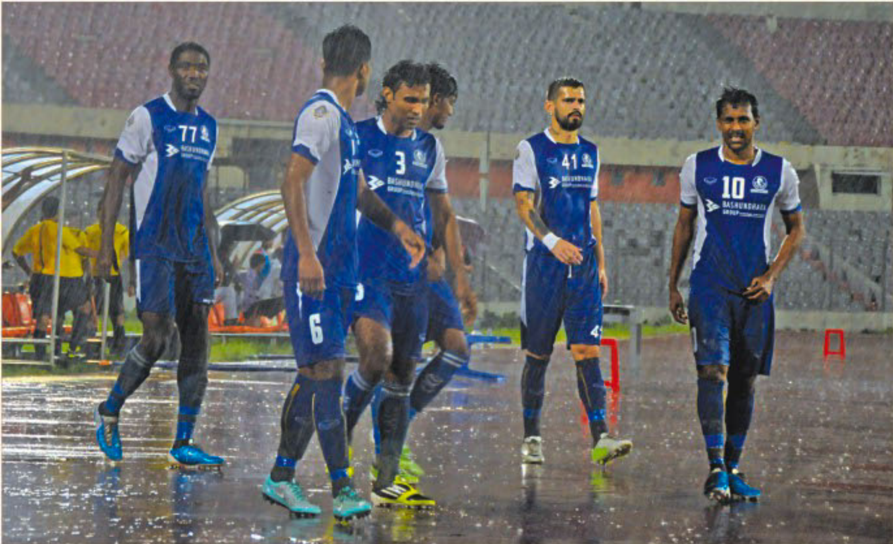
Sheikh Russel players walk off the pitch after heavy rainfall led to abandonment of their scheduled Bangladesh Premier League match against Farashganj SC at the Bangabandhu National Stadium yesterday.