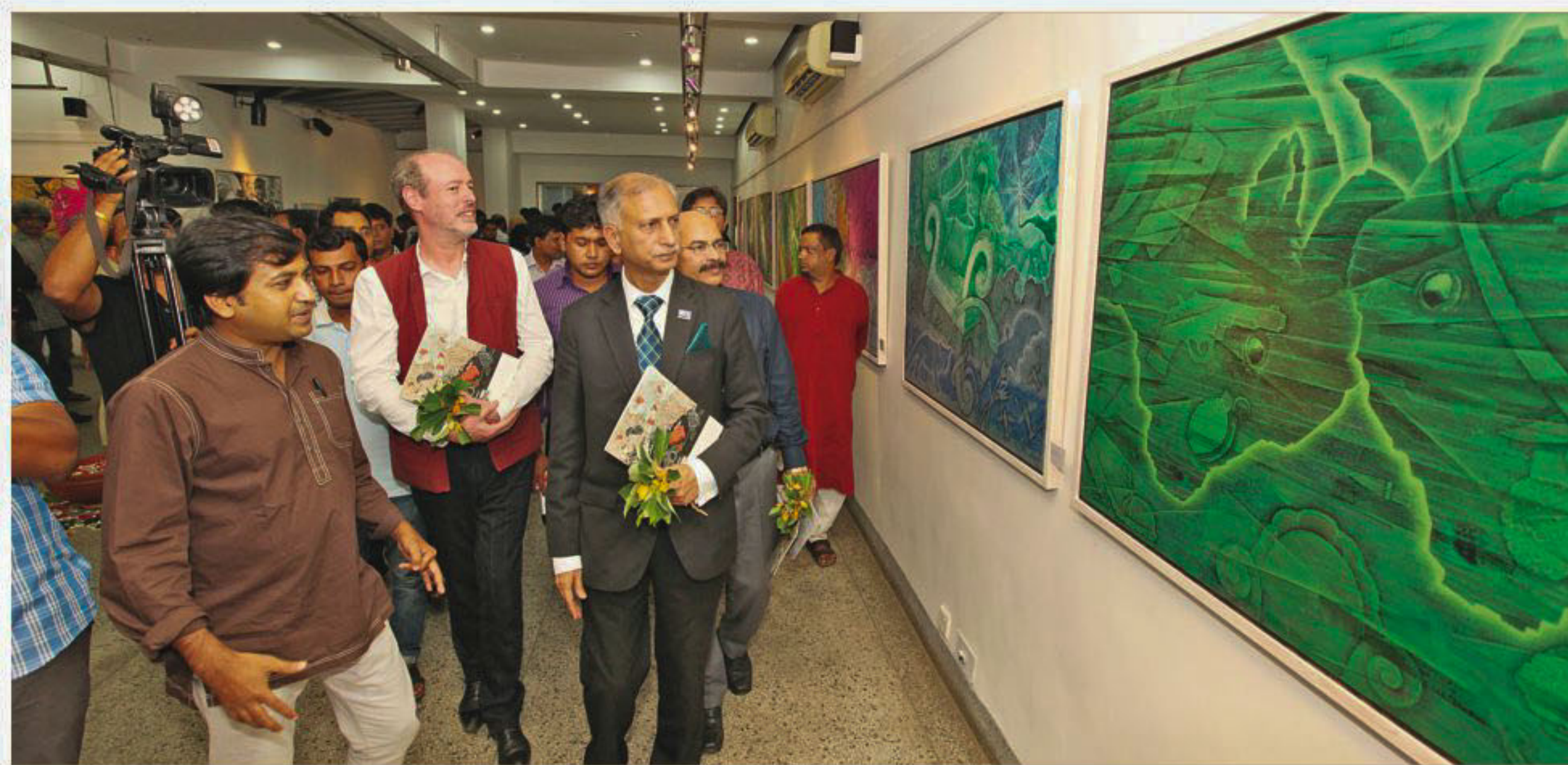
Distinguished guests visit the exhibition after inauguration.

Harun-ar-Rashid Tutul's Colliding Collages at AFD