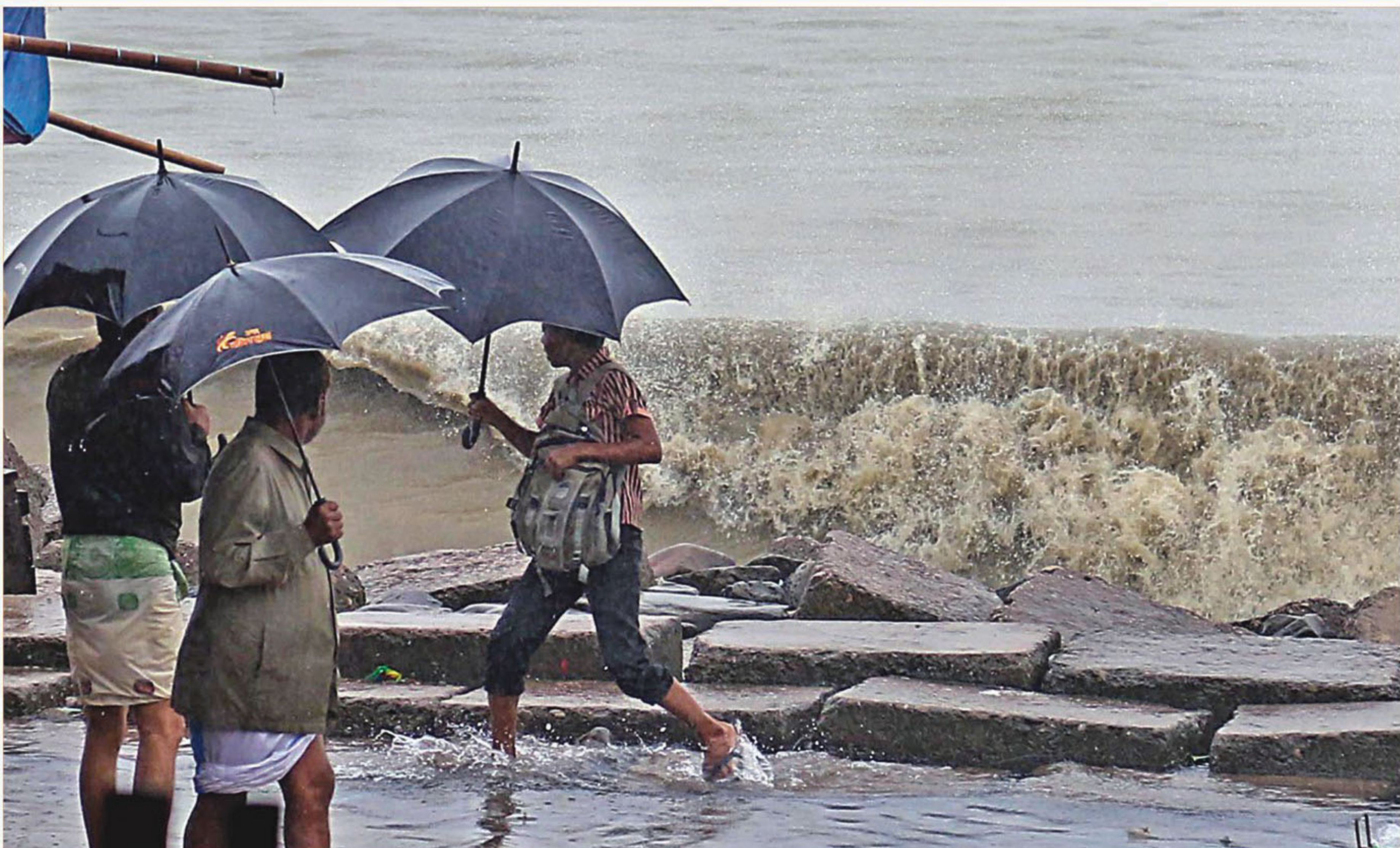
The sea beach in Patenga of Chittagong drew a significant number of visitors yesterday although the meteorological office declared the cautionary signal no. 7 in the area because of the advancing cyclone 'Komen', which was supposed to make landfall off Chittagong's coast in the evening. The photo was taken around 11:00am.