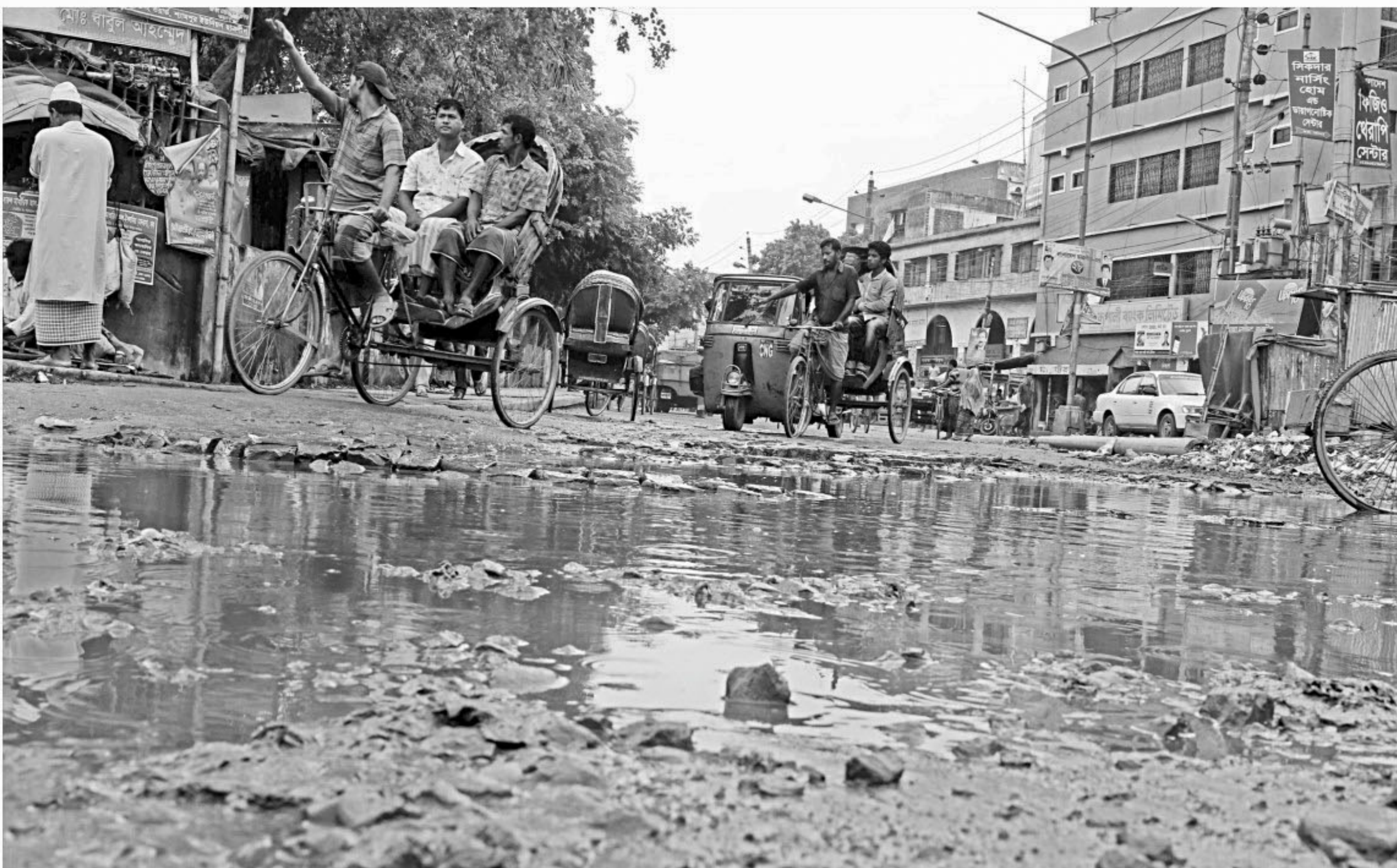
The approach road to Postogola Bridge in the capital is in a terrible state causing immense sufferings to commuters and damaging vehicles. The photo was taken yesterday.