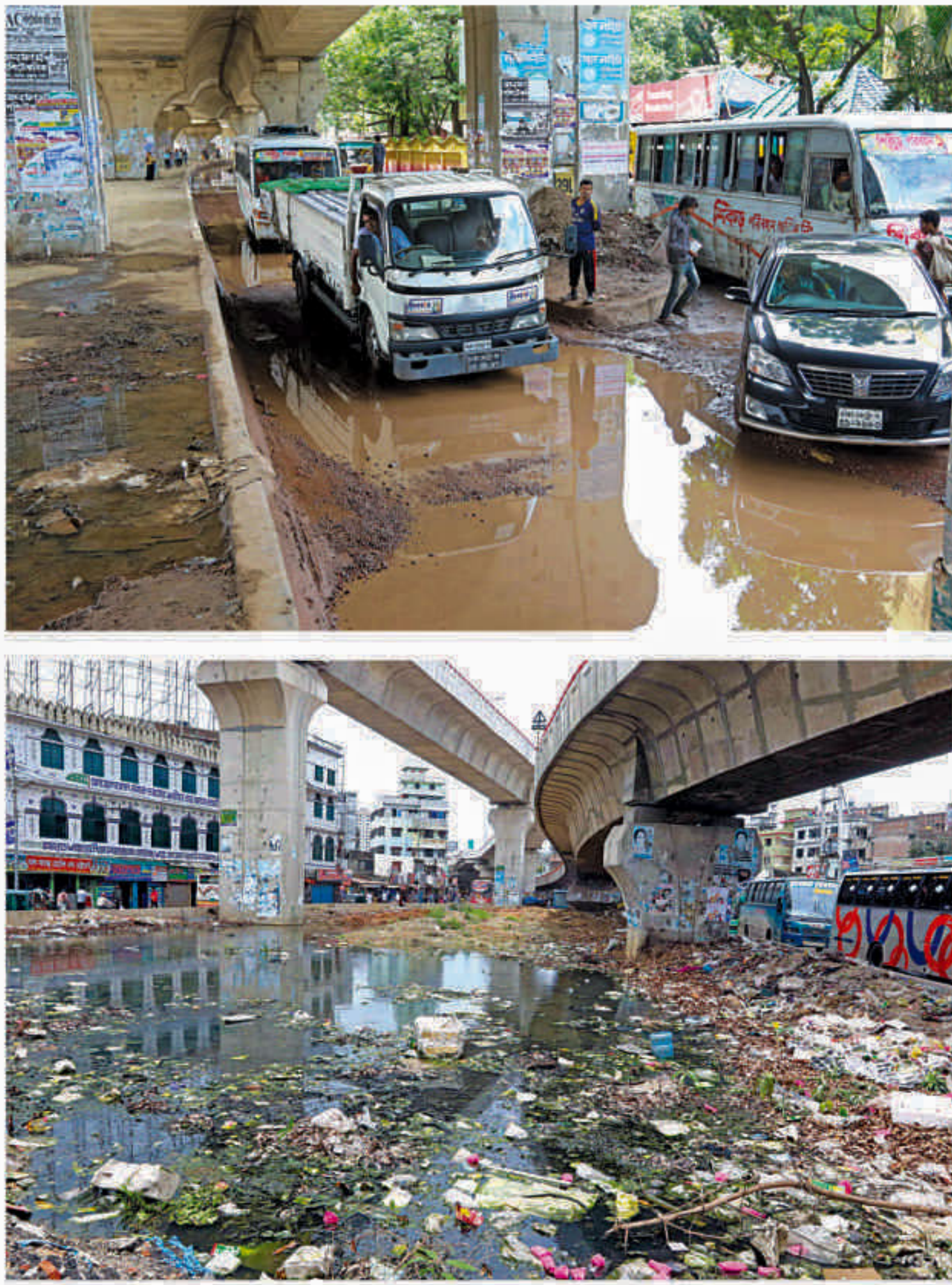
Dilapidated roads under Mayor Mohammad Hanif Flyover in the capital's Sayedabad. As there is no enforcement of traffic laws, inter-district buses stop here to pick up passengers, causing tailbacks on the roads. Things beneath the flyover get even worse with locals dumping waste at will. And the authorities concerned keep turning a blind eye to all this. The photos were taken yesterday.