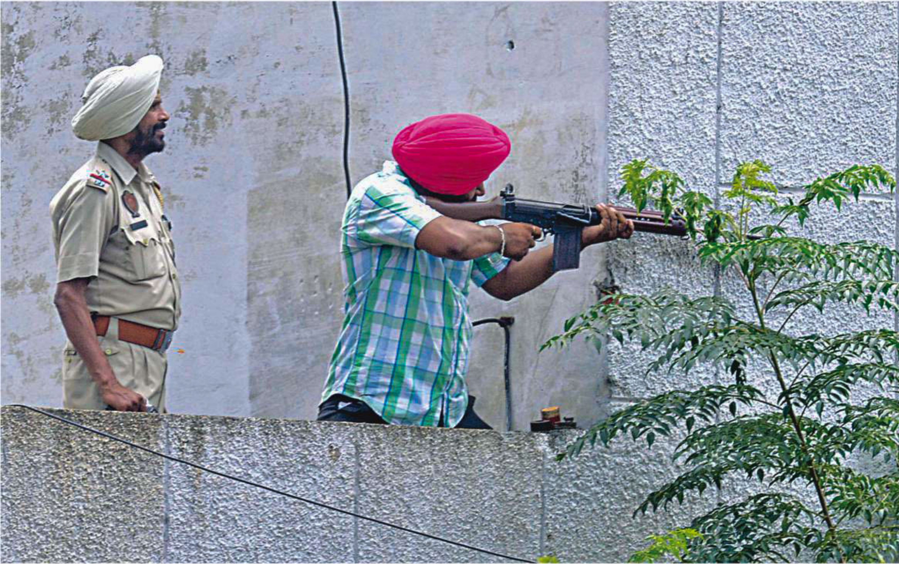
An Indian policeman fires during an encounter with armed attackers at the police station in Dinanagar town of Punjab state yesterday. Indian security forces were battling an armed attack on a police station near the Pakistan border in which at least 10 people were killed.