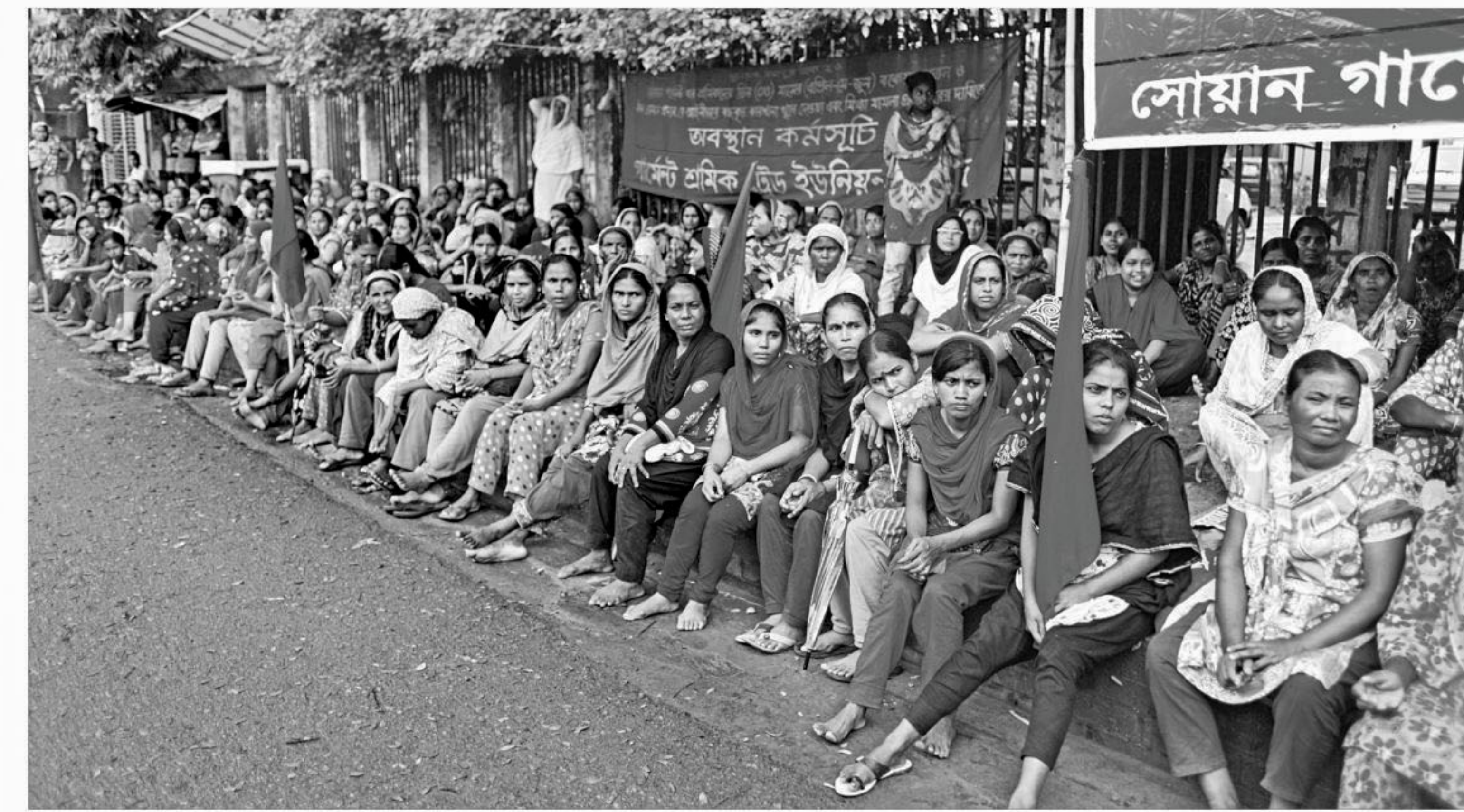
Workers of Swan Garments, which was closed unannounced in April leaving its 1,300 workers jobless all of a sudden, continue their sit-in in front of the capital's Jatiya Press Club yesterday, demanding arrears, Eid bonuses and reopening of the factory.

Drivers of CNG-run three-wheelers in Postogola Bridge area of the capital yesterday suspended their operation over the bridge protesting a hike of the toll. The strike caused sufferings to thousands of commuters, many having to walk more than 1km. The protesters shouted slogans against the hike, from Tk 10 earlier to Tk 25 now, gathering in the bridge area. The new toll chart was put into effect yesterday afternoon. Some protesters said they would launch a movement today. Aftab Ahmed, additional chief engineer of Roads and Highways Department (RHD), which is charging the toll, said the new toll rates were fixed by the cabinet. According to the new chart, trailers which did not have to pay any toll earlier has to give Tk 750 now, heavy trucks Tk 240, medium trucks 225, big buses Tk 35, and mini-trucks Tk 170. Earlier, all these trucks and buses were charged Tk 30. The new toll amount was raised from Tk 20 to Tk 25 for minibus, from Tk 20 to Tk 75 for microbus, and from Tk 10 to Tk 25 for all motorised three- and four-wheelers. The new chart also fixed Tk 15 for motorcycle and Tk 10 for rickshaw, van and pushcart. None of these vehicles had to pay tolls earlier.