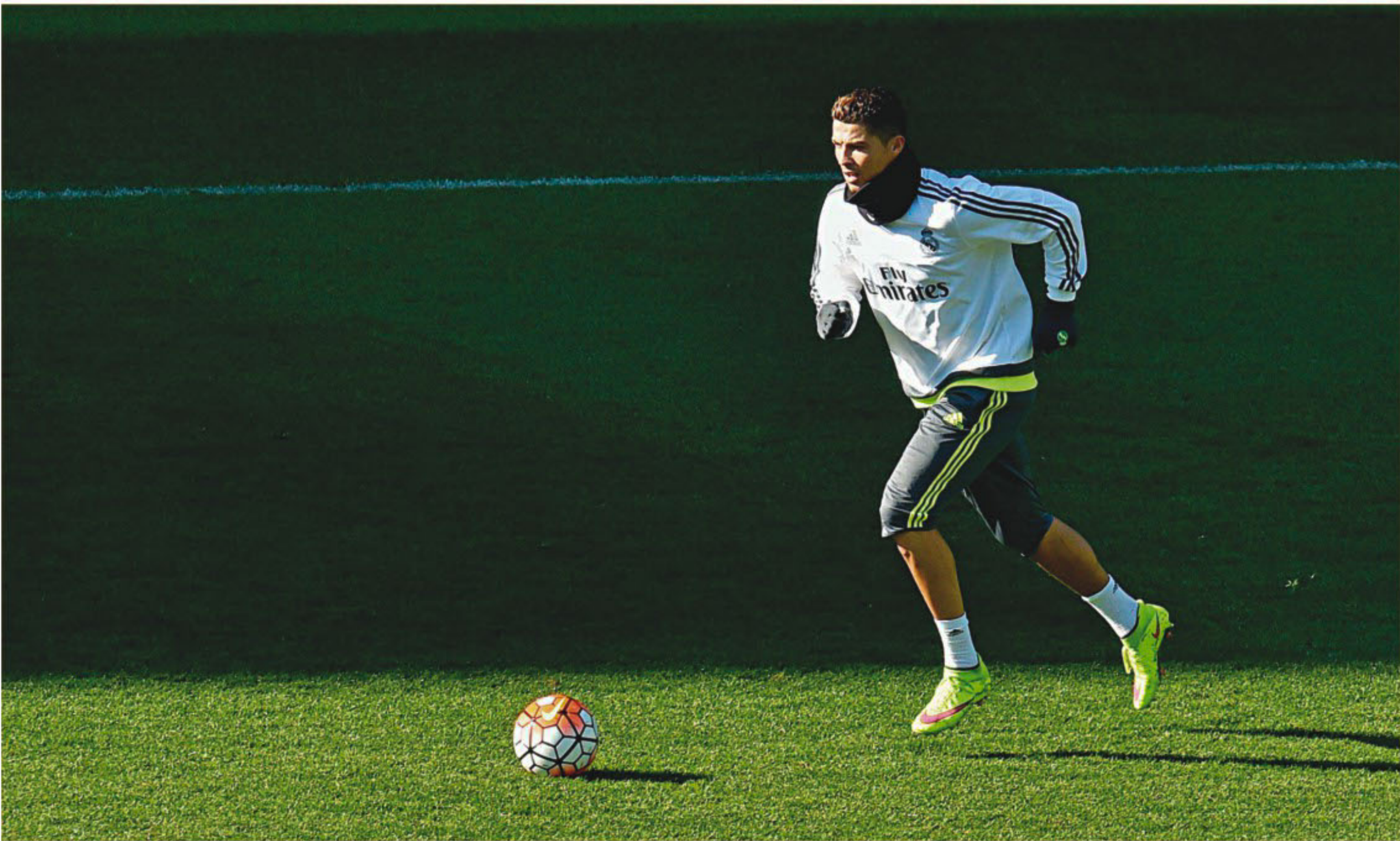
Real Madrid superstar Cristiano Ronaldo runs with the ball during a training session in Melbourne yesterday.

Ronaldo is the world's third-highest paid sportsman this year after boxers Floyd Mayweather and Manny Pacquiao.