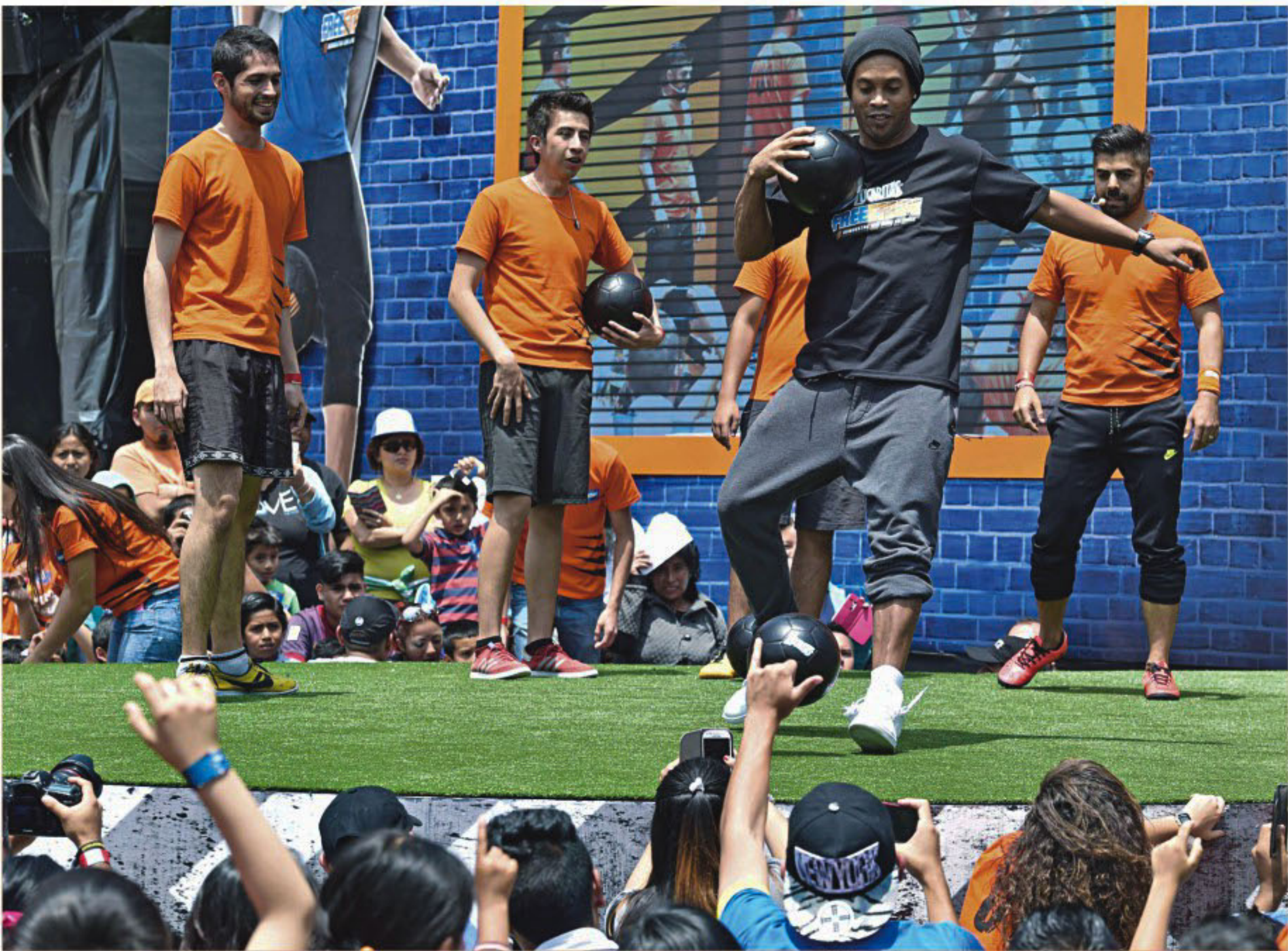
Former Brazil star Ronaldinho (C) kicks balls towards children attending a class of Free Stripe promoted by a private enterprise in Mexico City on Wednesday.

Gatlin has run 9.74sec for 100m this year and Bolt a modest 10.12sec in his only race at the distance in 2012 - in Rio de Janeiro in April.