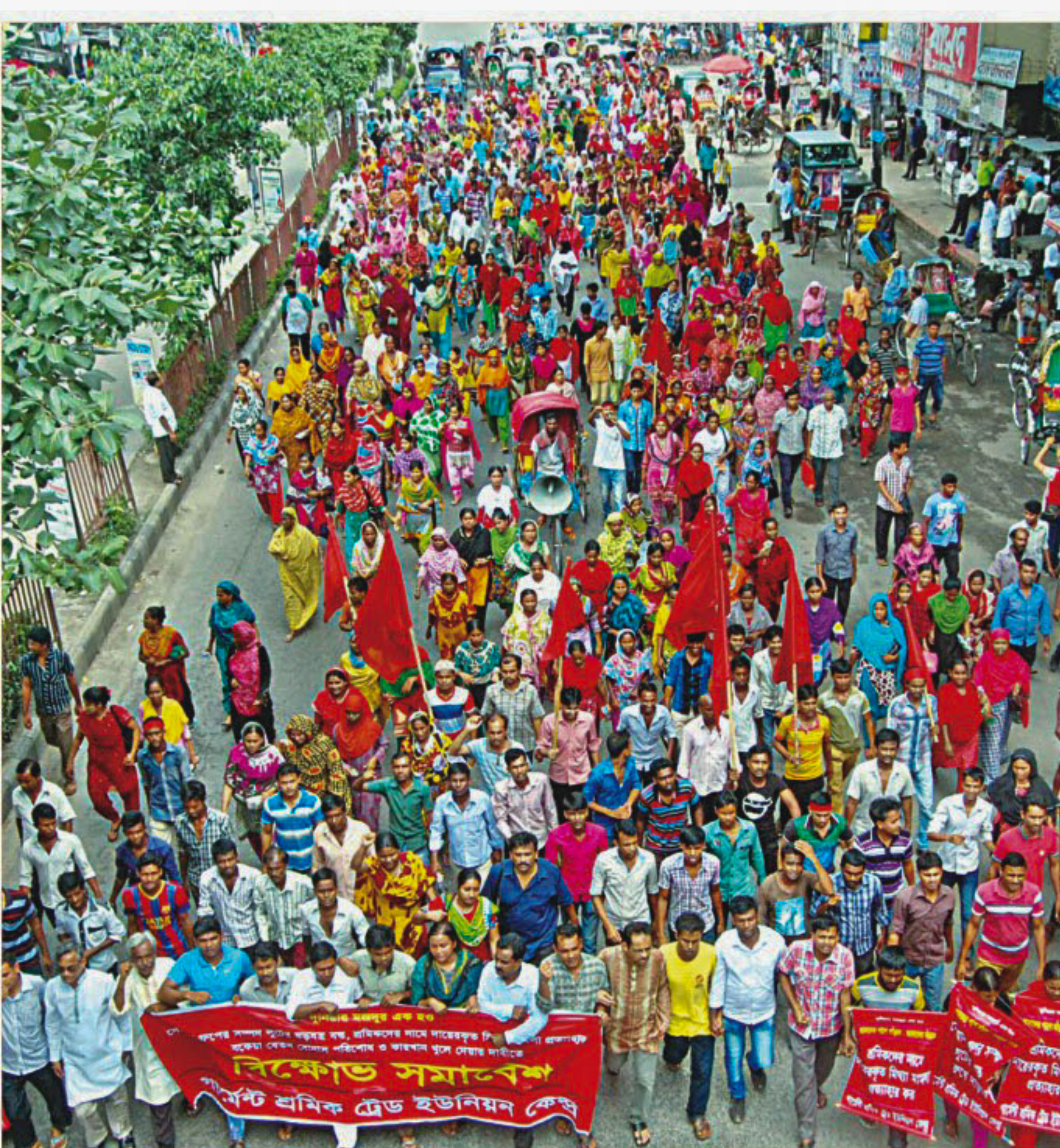
Garment Sramik Trade Union Kendra brings out a procession in the capital yesterday demanding withdrawal of "false" cases against Swan Garment workers and payment of their due salaries and Eid bonuses.