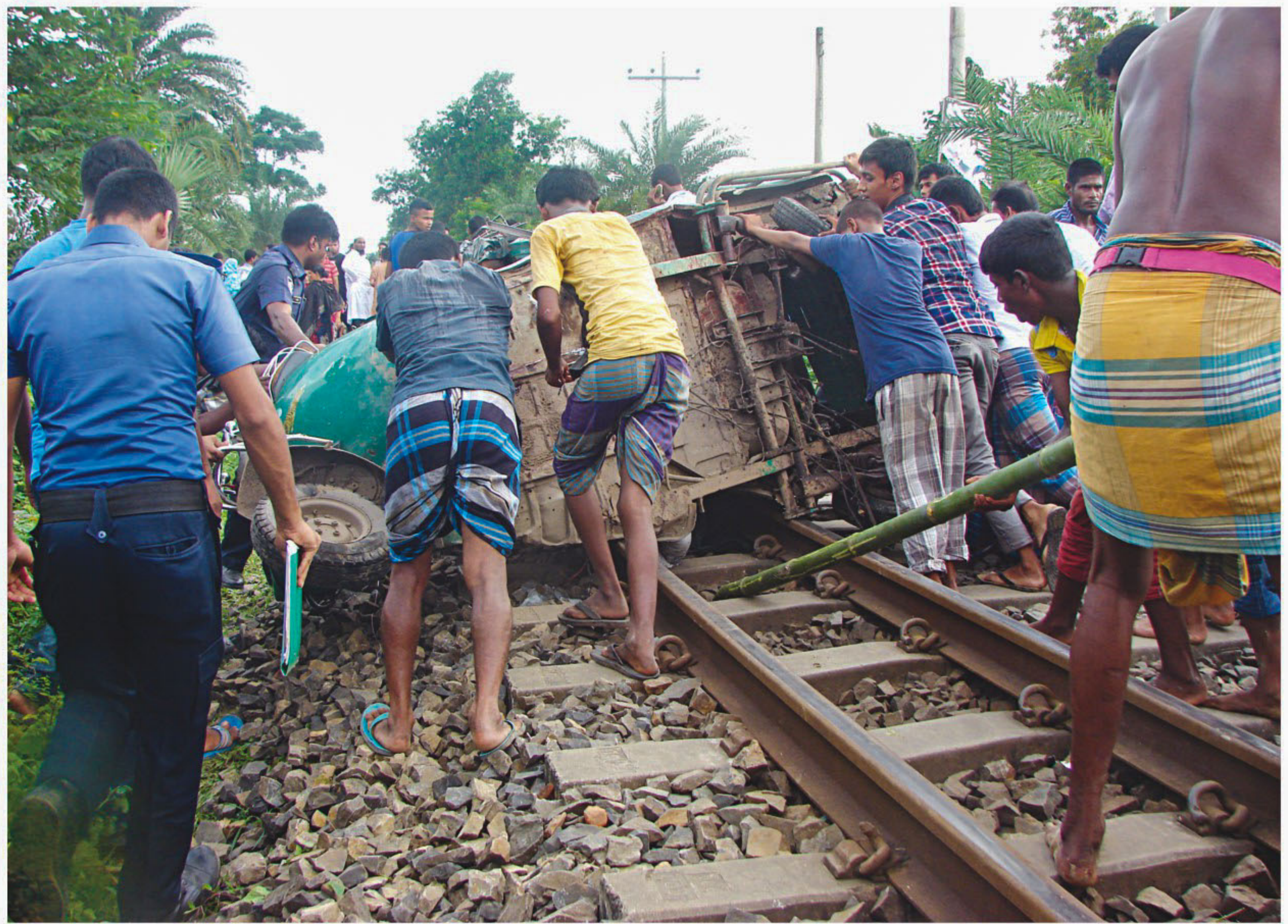
People remove a CNG-run auto-rickshaw from the rail line at Hyderabad in Joydevpur of Gazipur yesterday after it was hit by a train while crossing an unapproved level crossing. The vehicle was dragged 500 metres on the lines before the train could come to a halt.

But scientists have years to pore over the data it has returned in order to narrow the search for Earth-like worlds.