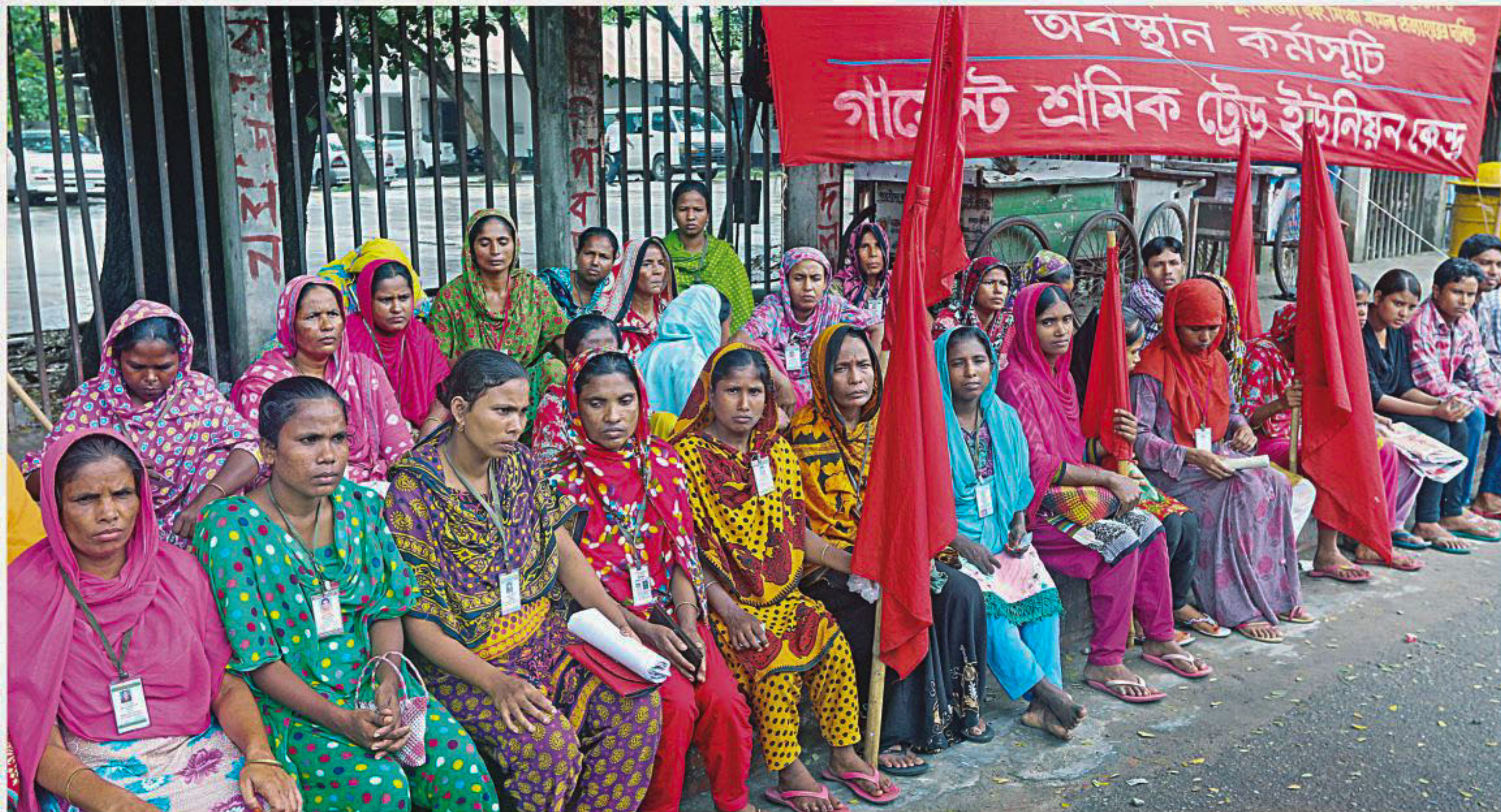
Workers of Swan Garments stage a sit-in outside the National Press Club in Dhaka yesterday, demanding due wages and Eid bonuses. The factory has been shut since April.