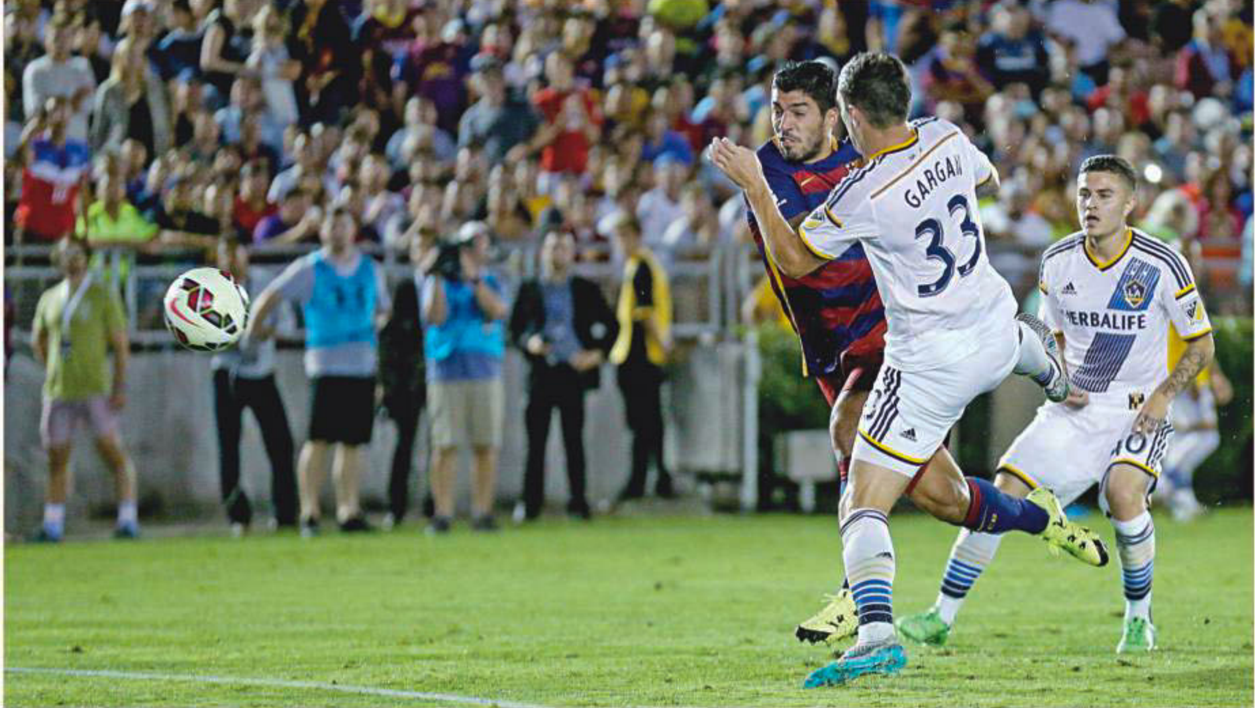
Barcelona striker Luis Suarez (L) scores the opening goal against LA Galaxy during their International Champions Cup tie in Pasadena on Tuesday.