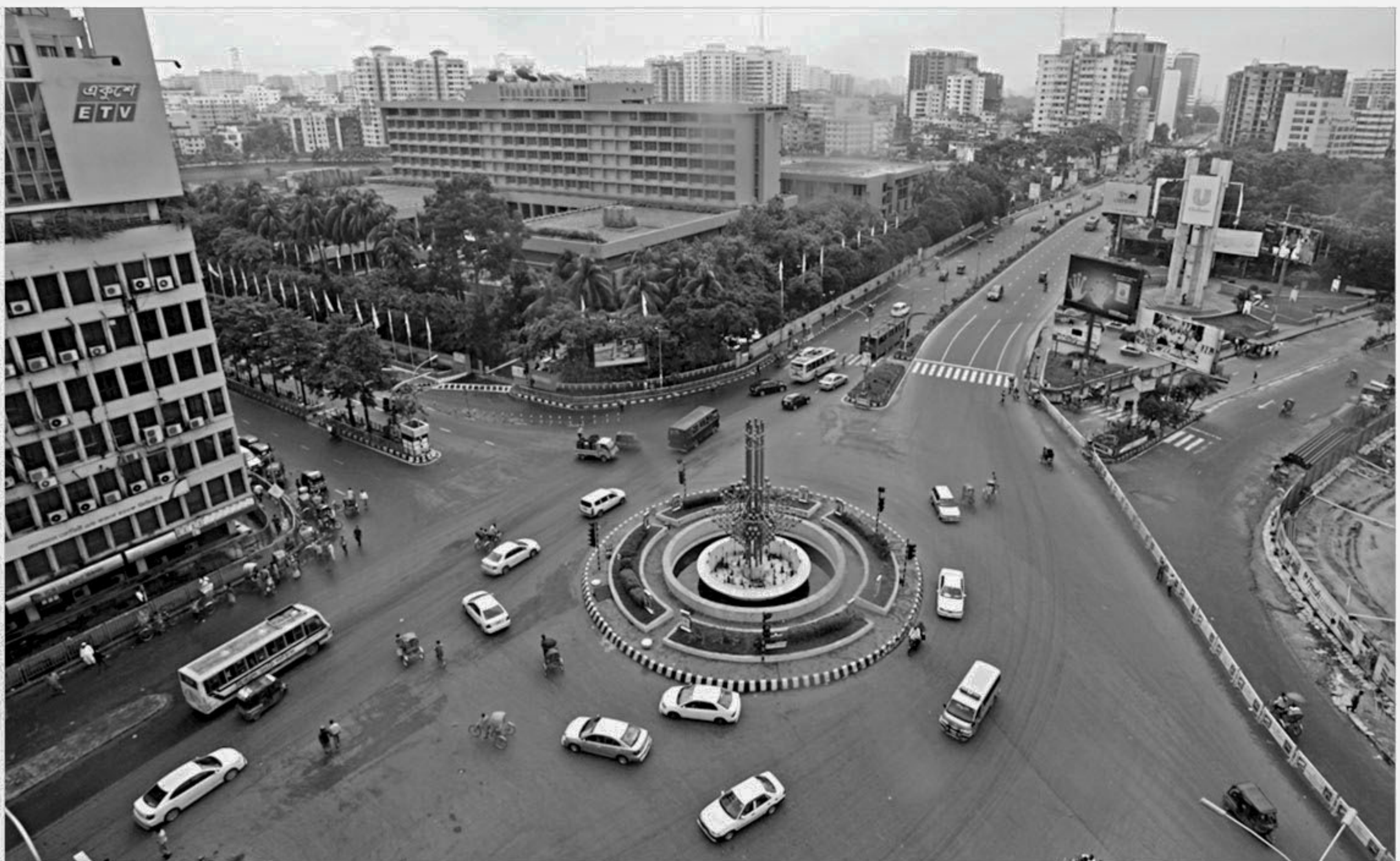
Sparse traffic on the capital's Sonargaon intersection yesterday after Eid-ul-Fitr, celebrated on Saturday, with most of the people who left for their family homes to celebrate the occasion yet to return.