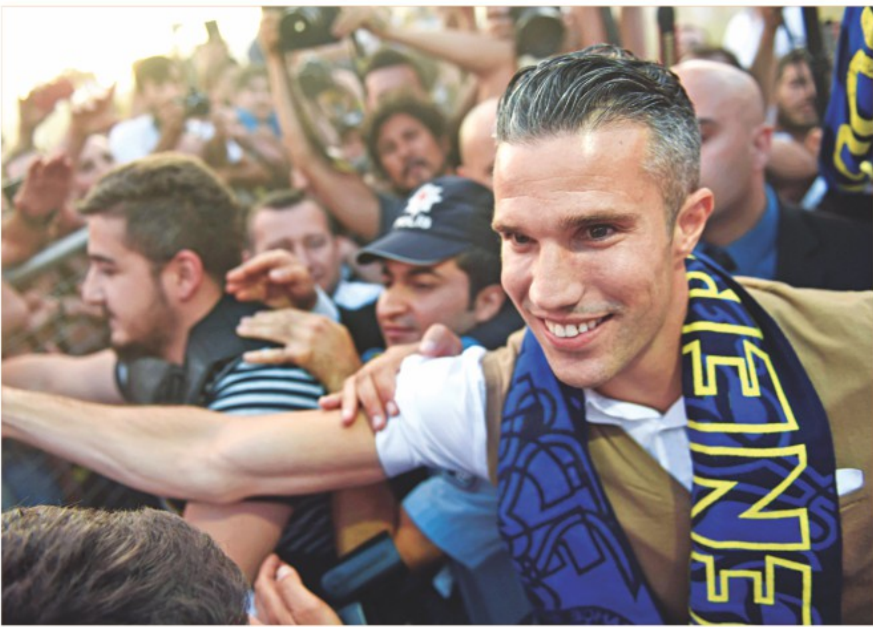
Fenerbahce's latest signing Dutch striker Robin van Persie (R) is greeted by fans upon his arrival at the Sabiha Gokcen Airport in Istanbul on Sunday.

He had been a free agent since leaving Mexican side Queretaro in June after a disappointing year at the club.