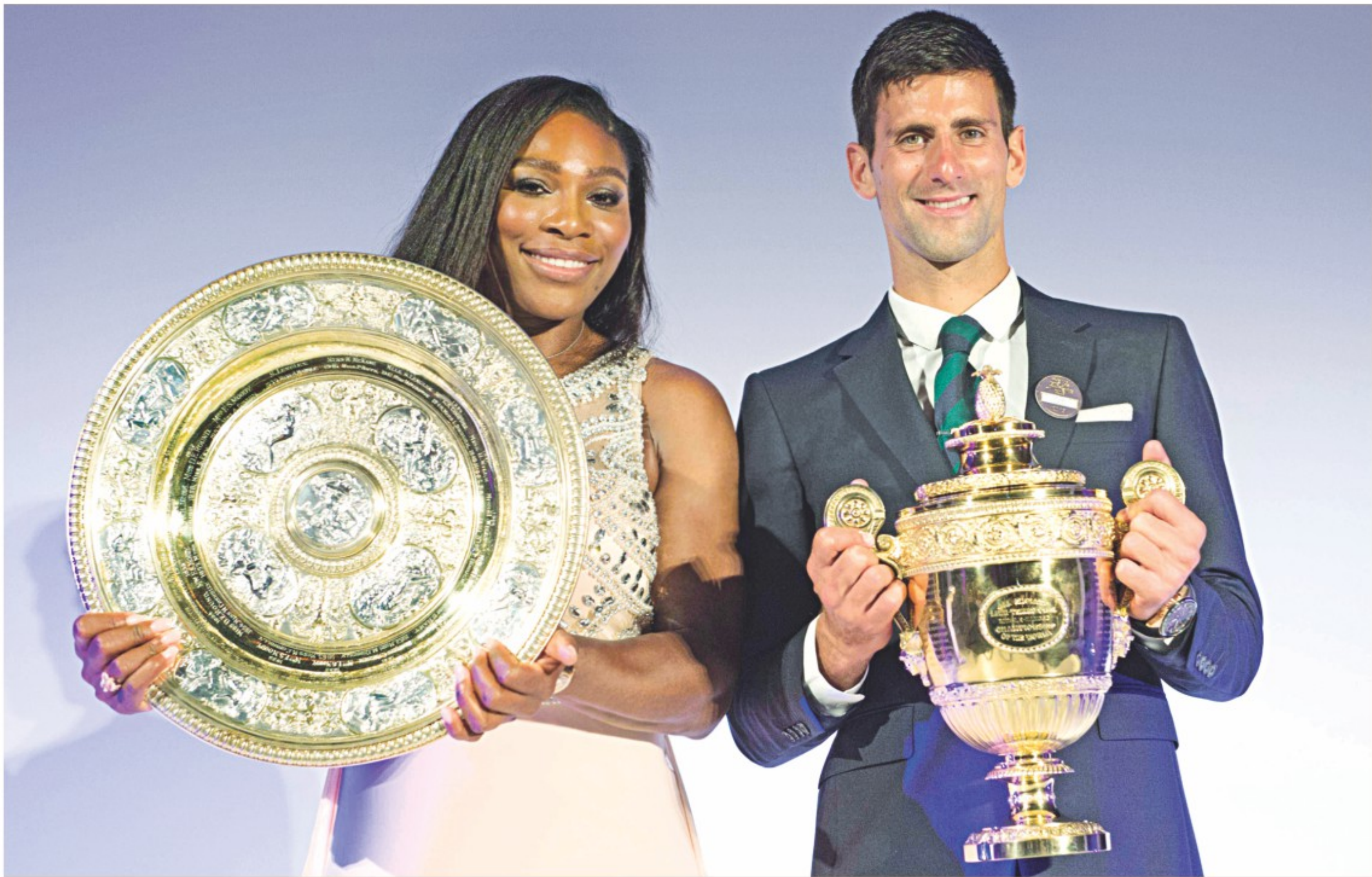
Wimbledon champions Serena Williams (L) of USA and Novak Djokovic of Serbia pose with their respective trophies at the Champions Dinner in London on Sunday.

Two months later, Sterling's relationship with the Liverpool hierarchy became even more strained when, in an interview with the BBC given without the club's approval, he confirmed he had rejected the Reds' latest contract offer.